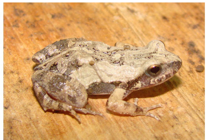
FIGURE 1. An adult male of Physalaemus cicada collected buried, from Ouricuri municipality, Pernambuco, Brazil.

This is the second records of P. cicada at Rio Grande do Norte state, extending the known distribution at 140 Km west from the municipality of Santa Maria, state of Rio Grande do Norte (05°50'01.78"S, 35°44'20.37"W) (Jorge and Freire 2012). The municipality of Brejo do Piauí is