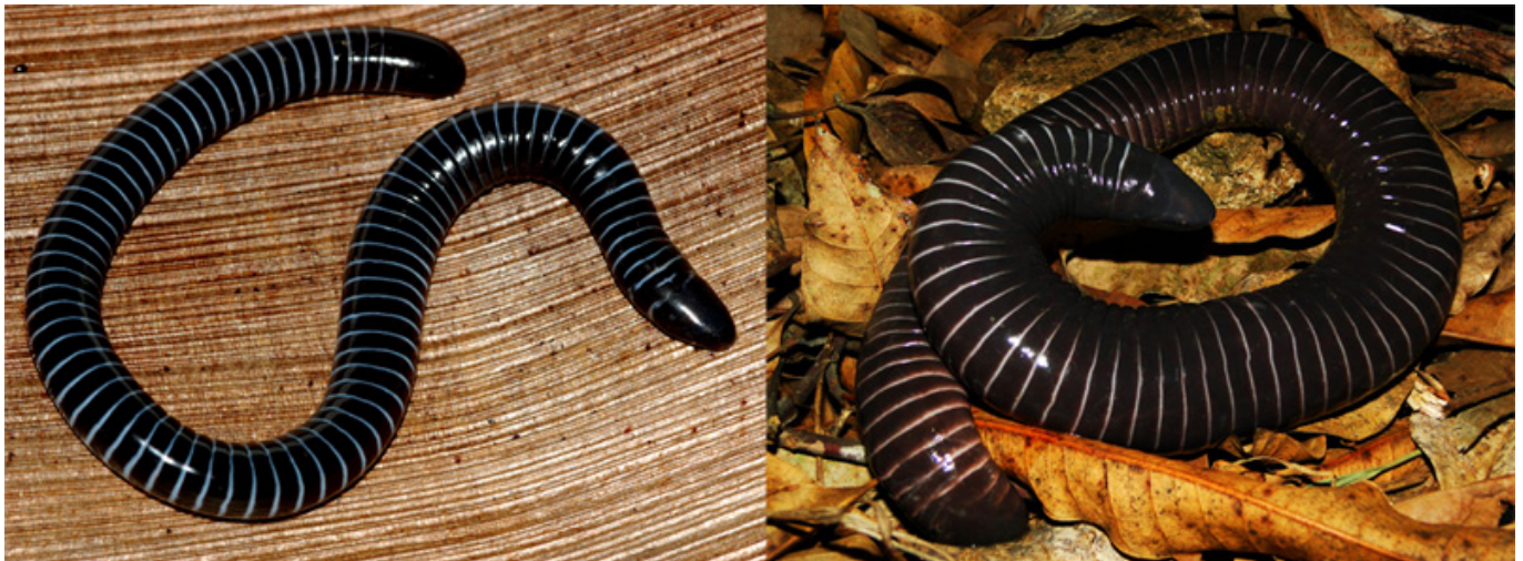
FIGURE 1. Specimens of Siphonops annulatus from Pará, Brazil. Left: MPEG 33734, 220 mm total length, municipality of Itaituba ; Right: MPEG 32559, 539 mm total length, municipality of Senador José Porfírio.