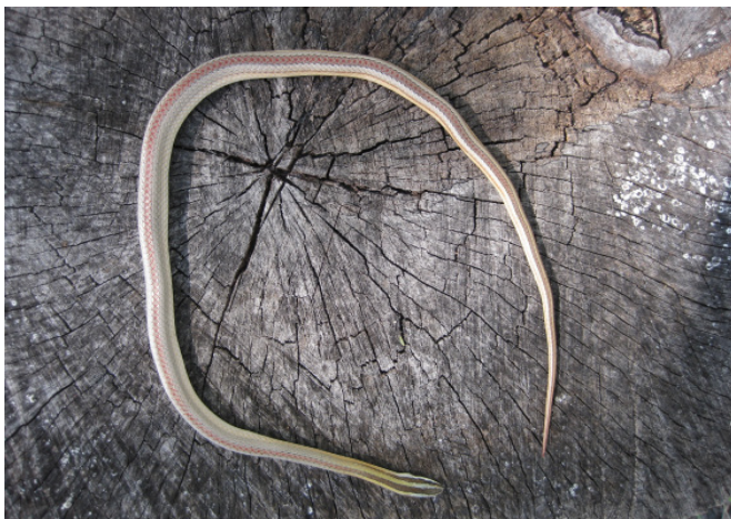
FIGURE 2. Specimen of Lygophis paucidens (CZPLT-H-122) found at Reserva Natural Laguna Blanca, in San Pedro Department, Paraguay.

EDITORIAL RESPONSIBILITY: Ross MacCulloch