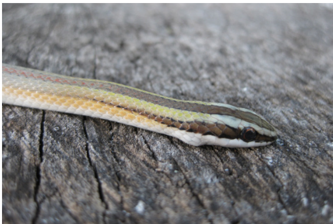
FIGURE 3. Detail of the head of L. paucidens (CZPLT-H-122).