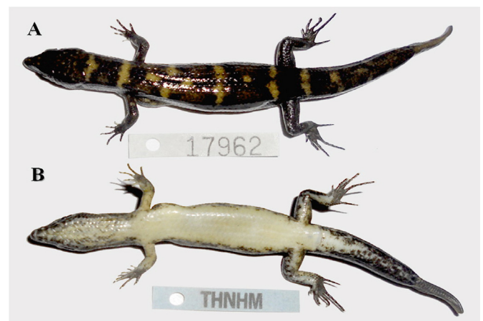
FIGURE 1. Dorsal (A) and ventral (B) views of an adult female Tropidophorus robinsoni (THNHM 17962) from Khlong Saeng Wildlife Sanctuary, Surat Thani province, southern Thailand.

Tropidophorus robinsoni was previously known only from the type locality "Tasan, W. of Chumphon, P. Siam" (Smith, 1919), Khao Lak in Phang-nga Province, Thailand (Pauwels et al. 2000) and from Tanintharyi Division in Myanmar (Wogan et al. 2008). The new locality thus represents the first provincial record for Surat Thani Province (southern Thailand), the fourth locality for the species, and it partly fills approximately 200 km hiatus