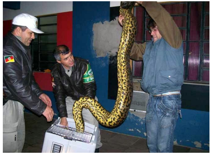
FIGURE 3. Eunectes notaeus individual found in São Borja, Rio Grande do Sul state, Brazil as it was being prepared by the Province's Environmental Police (PATRAM; Patrulha Ambiental do Estado do Rio Grande do Sul) to be transported to the Brazilian Institute of Environment and Renewable Natural Resources (IBAMA; Instituto Brasileiro do Meio Ambiente e dos Recursos Naturais Renováveis), at the municipality of Santa Maria, Rio Grande do Sul State, Brazil ( http://zerohora.clicrbs.com.br/rs/noticia/2009/09/sucuri-e-capturada-em-uruguaiana-2657653.html ).

was sent to São Braz Conservationist Breeding (Criadouro Conservacionista São Braz) at municipality of Santa Maria (29°41'36.68"S, 53°49'16.80"W), state of Rio Grande do Sul; and the third was released in São Donato Biological Reserve (SDBR), between the municipalities of Itaqui and Maçambará (29°08'01.11"S, 56°18'30.51"W).