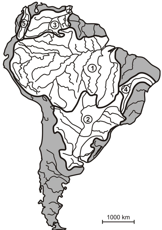
FIGURE 1. Main South American hydrographical basins (modified from Tundisi, 1994). 1 - Amazon basin; 2 - Río de La Plata basin; 3 - Orinoco basin; 4 - São Francisco basin; 5 - Magdalena basin.

São Borja are situated the basin of the Butuí and Icamauá rivers, tributaries of the Uruguay River; and the Puitã River and its tributaries, forming several swamplands named