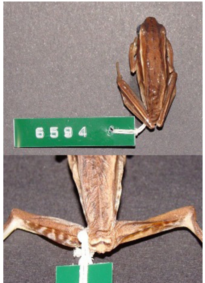
FIGURE 1. Hypsiboas caingua collected in the municipality of Tacuru, state of Mato Grosso do Sul, Brazil (MHNCI 6594). Upper, dorsal view; below, detail of the concealed surfaces of thigh.

is located around 500 km far from the nearest previously reported site in southeastern Brazil (Figure 2). According to the updated geographic extension of H. caingua , there is a high probability that the species may also occur in the other southern states of Brazil.