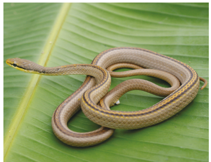
FIGURE 1. Symphimus leucostomus , found on a trail near La Cofradía, San Pedro Mixtepec, Oaxaca. Photograph by Jesús García Grajales (FCHU0135).

This is the first record from the Municipality of San Pedro Mixtepec. It not only represents the southernmost geographic record of S. leucostomus , but it also fills a large gap between the closest reported localities: approximately 198 km ENE near Mixtequilla in the Isthmus of Tehuantepec (Hartweg and Oliver 1940), and approximately 580 km WNW at the mouth of the Balsas River in Michoacán (García-Aguayo and Muñoz-Alonso 2007), (Figure 2). It is desirable that more information on the distribution of this Mexican species is promptly gathered given that there are still many gaps in its distribution, especially in the southwestern part of Oaxaca, and in Guerrero and Colima.