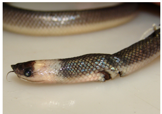
FIGURE 1. Phimophis guerini UFPB 4796 collected in Cruz do Espírito Santo, Paraíba, Brazil