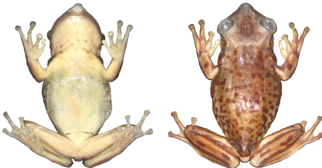
FIGURE 2. Specimen of Aparasphenodon brunoi (MZUSP 149809) collected in Caraguatatuba, São Paulo, Brazil.