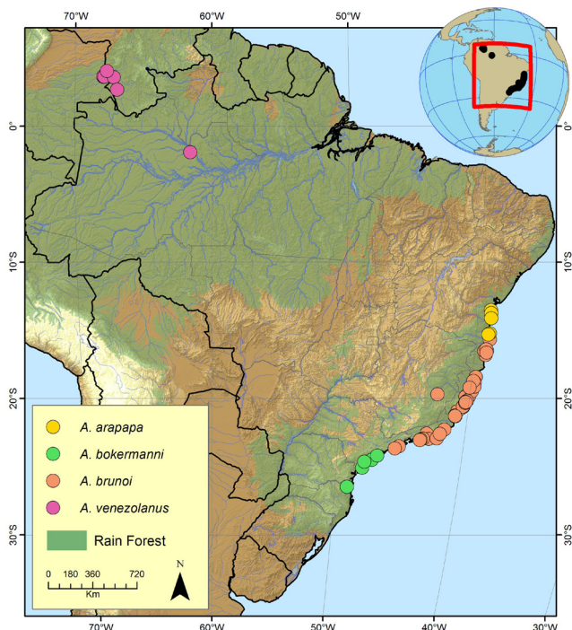
FIGURE 1. Geographic distribution map of Aparasphenodon species.

anesthetics, fixed in 10% formalin, preserved in 70% alcohol (ICMBio permit number I4555-3), and deposited in the herpetological collection of Museu de Zoologia da Universidade de São Paulo, São Paulo (MZUSP 149809).