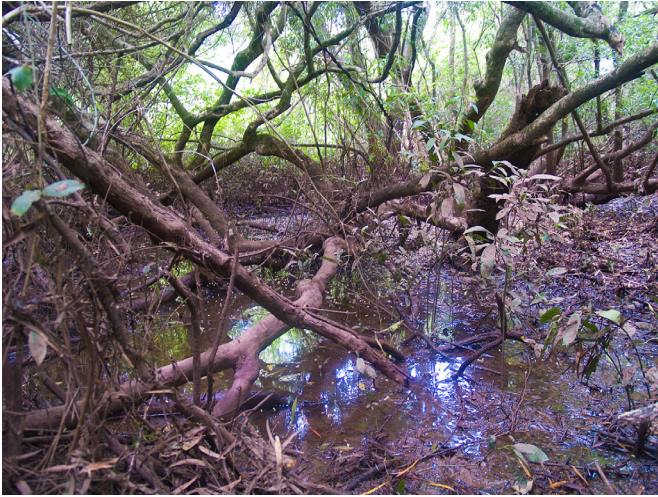
FIGURE 2. Riparian forest in Caballada Island at Uruguay River.

Specimens examined: Uruguay. Río Negro. Caballada Island: 26/03/2008, 1♀, A. Laborda, (FCE 5711); 23/03/2009, 1♀, A. Laborda, (FCE 5712); 26/03/2009, 1♀, A. Laborda, (FCE 5713); 19/12/2007, 1♀, A. Laborda, (FCE 5714); 26/03/2008, 2♀, G. Useta, (FCE 5715); 26/03/2008, 1♀, F. Pérez-Miles, (FCE 5716); 29/09/2007, 1♂, A. Laborda, (FCE 5717); 15/12/2008, 1♂, A. Laborda, (FCE 5718); 15/12/2008, 1♂, F. Pérez-Miles, (FCE 5719); 25/06/2008, 1J, A. Laborda, (FCE 5720); 25/06/2008, 1J, G. Useta, (FCE 5721); 25/06/2008, 1J, G. Useta, (FCE 5722); 24/09/2007, 1J, L. Montes de Oca, (FCE 5723); 19/12/2007, 1J, F. Pérez-Miles, (FCE 5726); 02/10/2008, 2J, A. Laborda, (FCE 5727); 25/06/2008, 2J, G. Useta, (FCE 5728); 25/06/2008, 1J, G. Useta, (FCE 5729); 15/12/2008, 1J, A. Laborda, (FCE 5730); 25/06/2008, 1J, L. Montes de Oca, (FCE 5731); 15/12/2008, 1J, L. Montes de Oca, (FCE 5732); 25/06/2008, 1J, G. Useta, (FCE 5734); 08/10/2009, 1J, F. Costa, (FCE 5737); 25/06/2008, 1J, F. Pérez-Miles, (FCE5738). Prefectura Naval: 16/12/2008, 1J, G. Useta, (FCE 5724); 26/06/2008, 1J, A. Laborda, (FCE 5725); 16/12/2008, 1J, A. Laborda, (FCE 5733); 16/12/2008, 1J, L. Montes de Oca, (FCE 5735); 16/12/2008, 1J, F. Pérez-Miles, (FCE 5736).