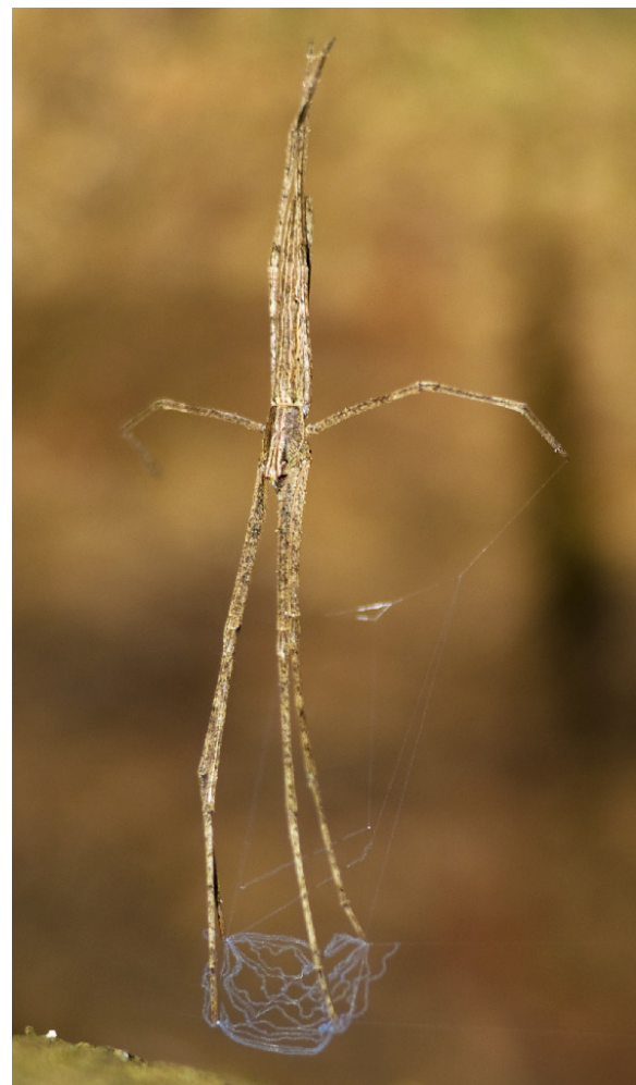
FIGURE 1. Deinopis amica and its web.

millimeters): females (N=7): total length: 15.55 \pm 2.65 ; carapace length: 4.15 \pm 0.45 ; carapace width: 2.60 \pm 0.30 ; males (N=3): total length: 13.80 \pm 1.00 ; carapace length: 3.95 \pm 0.05 ; carapace width: 2.50. We deposited voucher specimens in the arachnological collection of Facultad de Ciencias Universidad de la Republica (FCE), Uruguay.