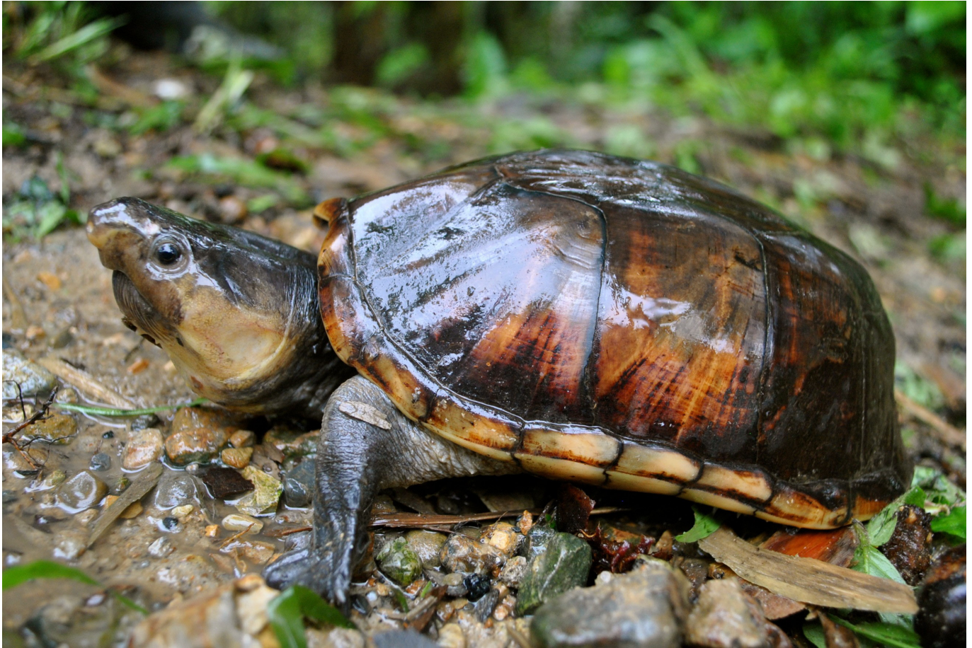
FIGURE 2. Adult male of Kinosternon dunnii captured and released during this study.

We recorded the species in two new localities during the field survey. In the first locality, Corregimiento Samurindó, Municipio del Atrato, Chocó (5°36'27" N, 76°38'25" W, WGS84, 35 m) (Figure 1), one individual was captured near the road after a rainfall event. The specimen was a male (CL = 141.9 mm, PL = 112.2 mm), which was collected and deposited in the Colección Científica de Referencia Zoológica del Chocó-Herpetología (COLZOOCH-H 0064) managed by the Grupo de Investigaciones en Herpetología de la Universidad Tecnológica del Chocó. The second locality, Corregimiento de San Isidro, Municipio Rio Quito, Chocó (5°37'31" N, 76°44'52" W, WGS84, 35 m), is beside the Quito River, which drains into the Atrato River (Figure 1). At this locality 17 specimens (seven males; nine