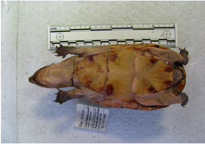
FIGURE 4. Specimen from the museum of the Instituto Alexander von Humboldt (IAVH 3715).

as K. leucostomum , but under close inspection, it clearly corresponded to a female of Kinosternon dunnii (CL = 115.4 mm, PL = 94.0 mm) as evidenced by the reduced plastral lobes (Figure 4). The locality for this specimen is Vereda la Playona, Acandí, Chocó (8° 28' 13.64" N, 77° 15' 02.77" W, WGS84, 30 m). It was collected in 1988 in a marshy area near the beach, within the floodplain of the Chugandi and Rionegro rivers, in an area used to grow rice, where natural vegetation had been completely cleared.