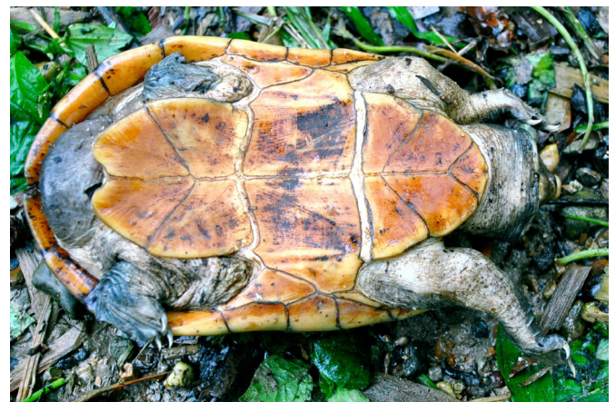
FIGURE 3. Ventral view of a male Kinosternon dunnii showing the reduced plastral lobes.

A third new locality corresponds to a specimen that is deposited in the museum of the Instituto Alexander von Humboldt in Villa de Leyva, Boyacá (IAVH 3715), and was identified by the authors during a recent visit to this museum (Figure 4). This individual had been classified