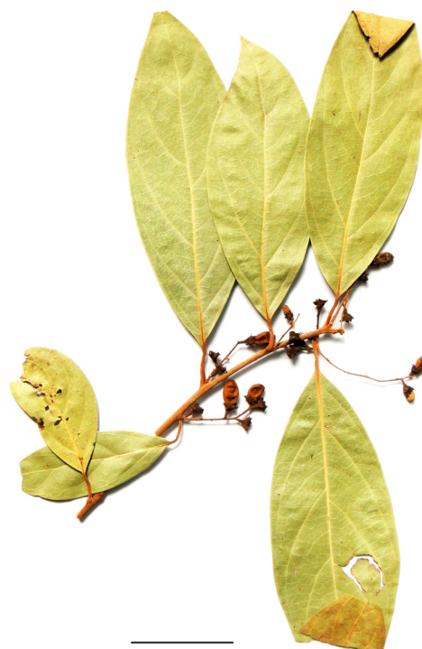
FIGURE 1. Sample of Endlicheria lhotzkyi collected at Mato Grosso do Sul, Brazil (scale bar = 8 cm).

We conducted this study by examining herbarium specimens from Mato Grosso do Sul state deposited in national herbaria. Only one Endlicheria lhotzkyi (Nees) Mez (Figure 1) specimen was found: BRAZIL. Mato Grosso do Sul: Sonora, July 2009, margin of the Rio Correntes - PCH Santa Gabriela, fr., Frison, S. s.n. (CGMS, ESA). The collect of E. lhotzkyi present two duplicates, deposited in the CGMS and ESA herbaria collections (acronym according Holmgreen et al. 1990) from University of Mato Grosso do Sul, Campo Grande-MS and University of São Paulo, Piracicaba-SP, respectively.