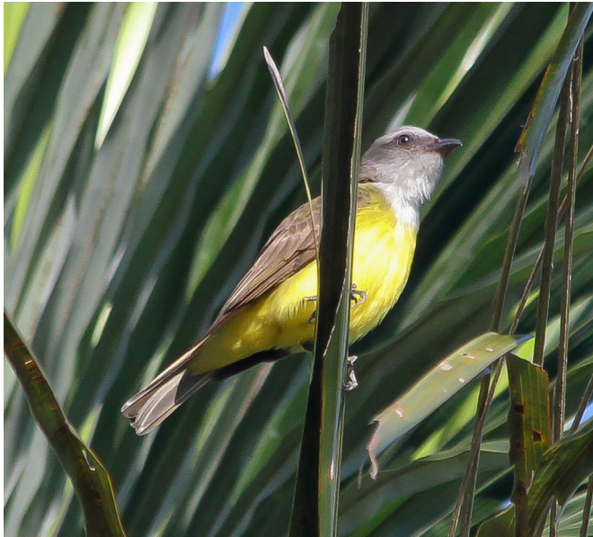
FIGURE 3. Tyrannopsis sulphurea photographed in the gallery forests of the Correntes River, State of Mato Grosso do Sul, Brazil.

of the state. There is very strong agricultural development in these regions, leading to increasing pressures on remaining forests. Thus, there is a need for further studies in order to fulfill gaps on distribution of these species in the state, as well as to indicate priority areas for conservation.