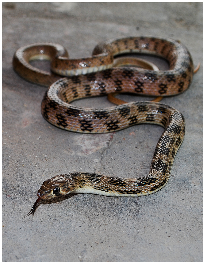
FIGURE 2. Entire body view of Glossy bellied racer snake ( Platyceps ventromaculatus )

On 26 th of March 2011, the Wildlife Rescue Helpline of Wildlife SOS received a call from a locality in West Delhi, Punjabi Basti, Anand Parbhat (28°38'59" N 77°10'12" E) regarding a snake that had entered their premises at around 14:45 h. The rescue coordinator Arshad Alam reached the location to find a snake hiding behind some utensils in a room on the 3 rd floor. He safely rescued the snake from the location but not being able to identify safely transferred it to a transport box and brought to the headquarters of Wildlife SOS. On 9 th of May 2011, in another rescue call from the same locality at around 10:30 h the police officials rescued a snake from someone's garage and handed over to the rescue coordinator Munish Gautam. The scale clipped by us differentiated these two individuals.