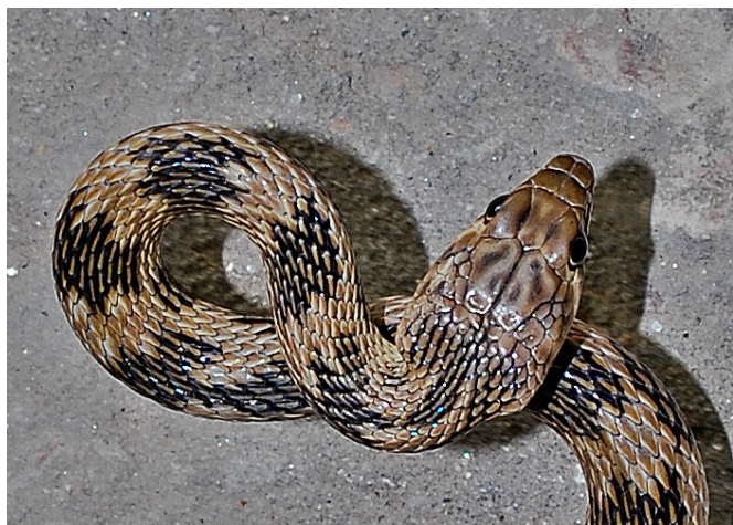
FIGURE 5. Close up view of Platyceps ventromaculatus (Top view).

This species is known from both northern and southern sides of the Indus River. However the sub-specific taxonomic status of this species is still inconsistent due to polymorphism (Khan 1997; Schätti and Schmitz, 2006). Following the current taxonomy (Whitaker and Captain, 2008), our current record of this species in a vast urban metropolis (New Delhi) points out to the presence of potential habitat for snakes even in a developed metropolis. One of our snakes ate a house gecko ( Hemidactylus flaviviridis ) when held in captivity for a short while. Further ecological studies on this snake may point out its ability to use the urban metropolis too for its survival.