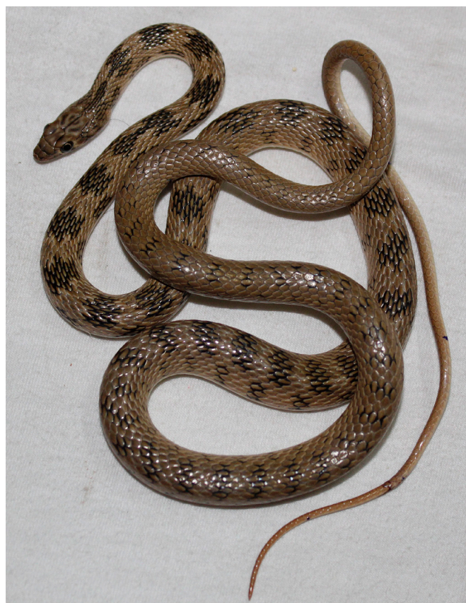
FIGURE 3. General body coloration of Platyceps ventromaculatus .

part of supra-oculars and one semi-circle with lateral band over parietals; head narrow with protruding snout, distinct from neck with prominent and protruding eyes having round pupils; an oblique black subocular streak on either sides across 5, 6 and 7 th supralabials scales; venter pale white with occasional black speckles on the sides; horizontal eye diameter 3.15-3.52 mm; distance from center of eye to posterior border of nostril 5.45- 5.65 mm; Snout-vent length 590-620 mm; tail length 205-225 mm; relative tail-length 0.258-0.265. The maximum total length as described by Whitaker and Captain (2008) being 1020 mm. The total length for males is 1090 mm and females is 1000 mm as detailed by Smith (1943). Based on this, the specimens found in New Delhi appear to be sub-adults. Judging from the relative tail length, the longer specimen with a longer relative tail length is a male whereas the other being female.