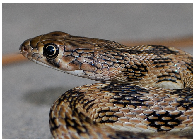
FIGURE 4. Close up view of Platyceps ventromaculatus (Lateral view).