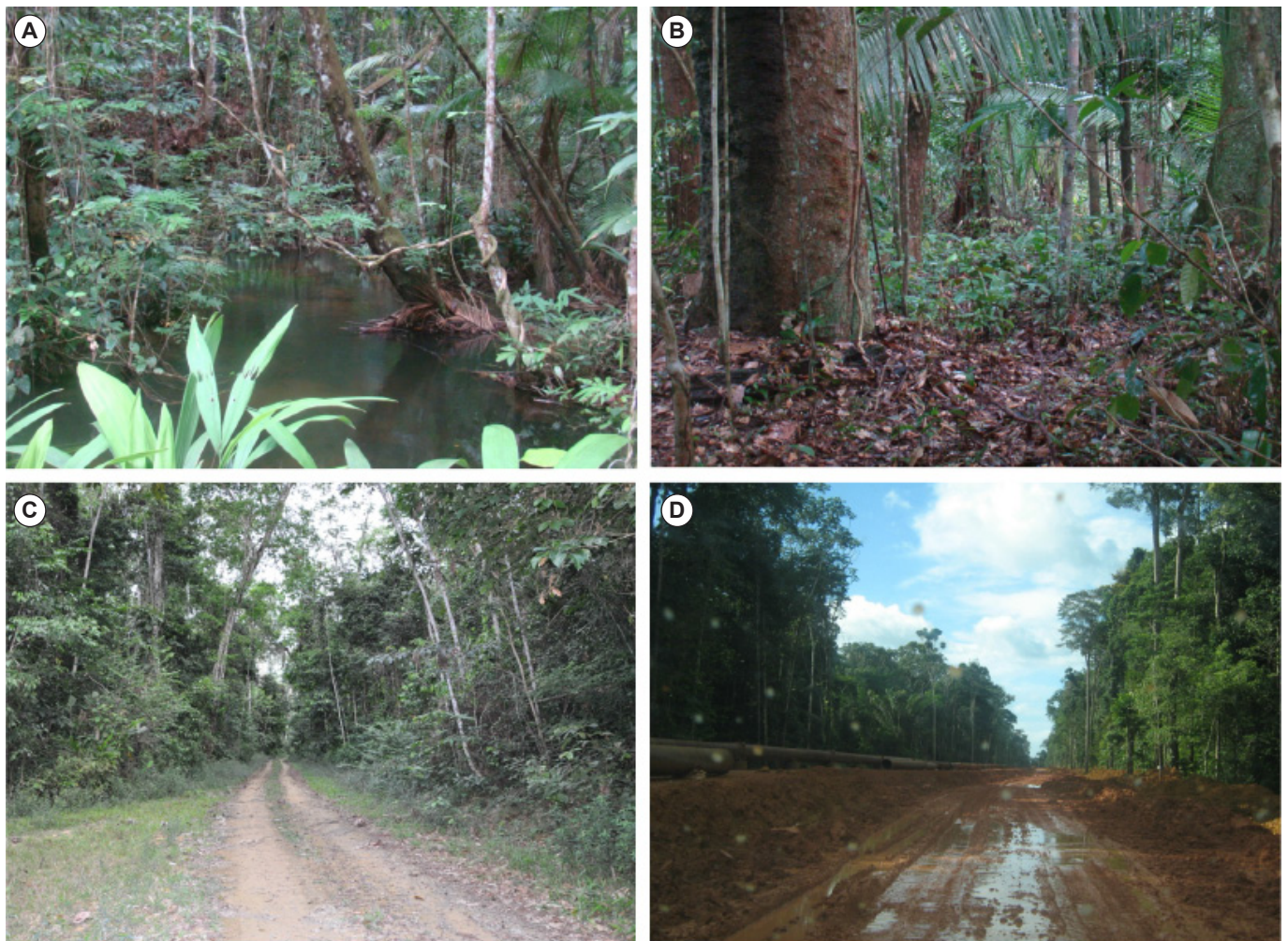
FIGURE 2. Environments sampled in the study area in the municipality of Juruti, State of Pará: (A) Igarapé, (B) Primary forest, (C) Secondary forest, (D) Disturbed area.

A total of 33 species (n= 622) of lizards were collected in the municipality of Juruti, state of Pará, belonging to 26 genera and ten families (Table 1, Figures 3 and 4). Gymnophthalmidae, with eight species (25% of the total species) was the family with highest species richness, followed by Teiidae, with six species (18% of the total species), Sphaerodactylidae with five species (15% of the total species), Dactyloidae and Tropiduridae with four species (12% of the total species) and Mabuyidae with two species (6% of the total species). In the families Gekkonidae, Iguanidae, Phyllodactylidae and Polychrotidae only one species was recorded (Table 1).