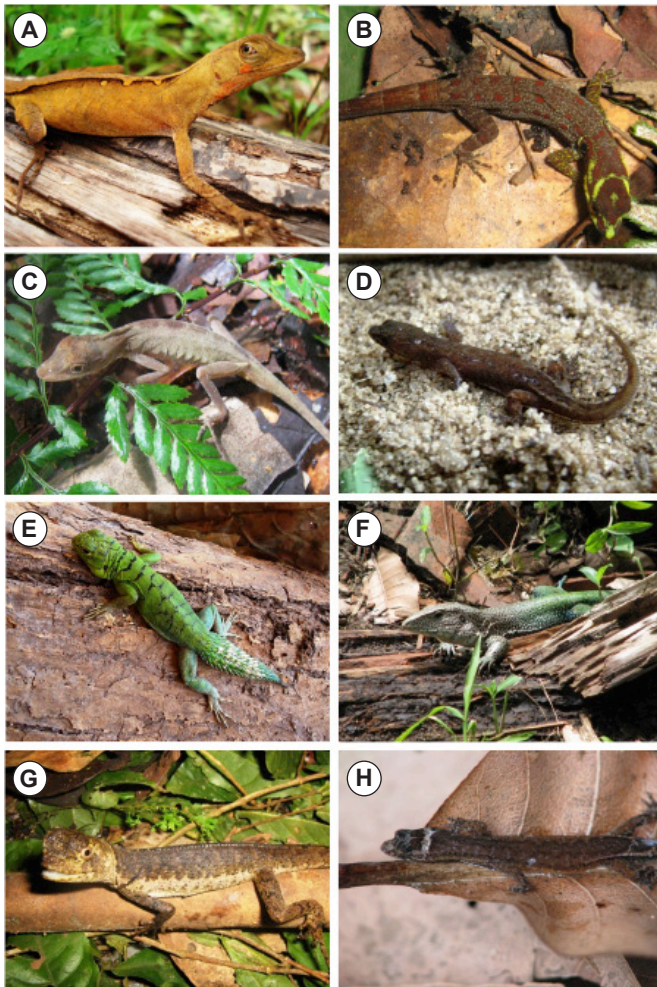
FIGURE 3. Some species of lizards recorded in the municipality of Juruti, State of Pará: (A) Norops tandai ; (B) Gonatodes humeralis ; (C) Norops fuscoauratus ; (D) Chatogekko amazonicus ; (E) Uracentron azureum ; (F) Ameiva ameiva ; (G) Uranoscodon superciliosus ; (H) Pseudogonatodes guianensis .