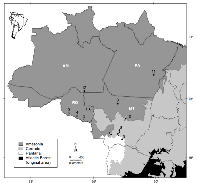
FIGURE 2. Known distribution of Elachistocleis magnus in the Brazilian states of Amazonas (AM), Mato Grosso (MT), Pará (PA), and Rondônia (RO). Star - type-locality, from Toledo (2010): Espigão do Oeste (1); open circles - literature records: Pimenteiras do Oeste (2) and Costa Marques (3), both from Caramaschi (2010), and Pedras Negras (4), from Brandão (2002); closed circles - new records (from the present report): Cuiabá (5), Chapada dos Guimarães (6), Porto Estrela (7), Nova Canaã do Norte (8), Santo Antônio do Leverger (9), Nova Uiratã (10), Parauapebas (11), and Manicoré (12).

das Araras, five adult males and 34 adult females were recorded following pitfall sampling efforts that totaled 6,820 bucket-nights, between April 2009 and June 2010. All captures occurred during the rainy season (from