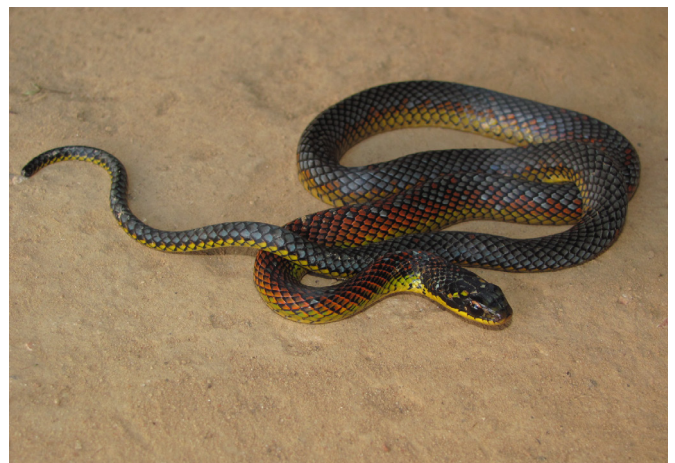
FIGURE 1. Liophis dorsocorallinus (UFAC-0378), female, SVL 460 mm, Parque Zoobotânico.

Following these characters from Esqueda et al. (2007) we assigned this species to Liophis dorsocorallinus (for additional squamation comparisons see Table 1).