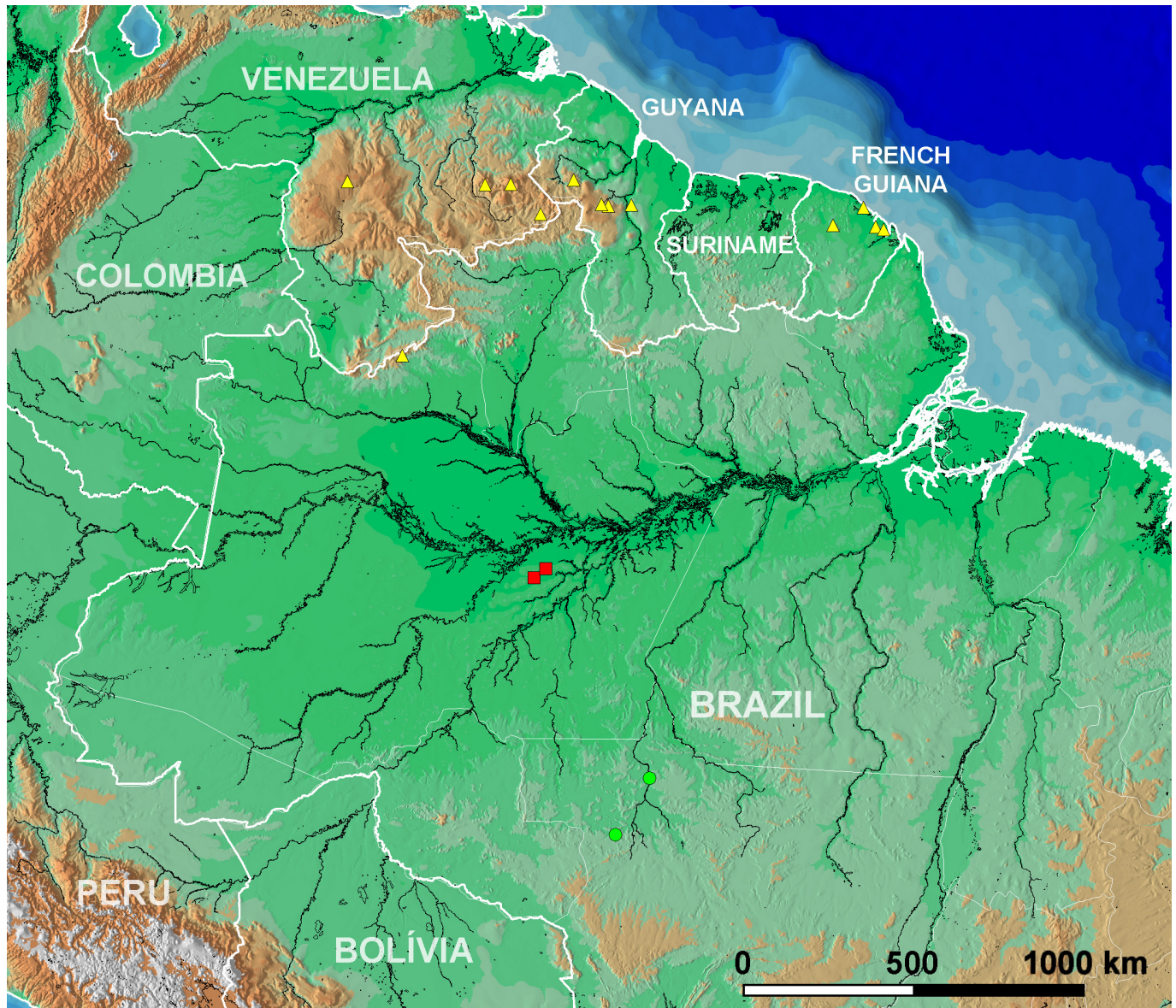
FIGURE 2. Known records of Hyalinobatrachium cappellei (van Lidth de Jeude, 1904). Red squares: the two new records, Municipality of Careiro, southwest of Manaus, Amazonas state, Brazil (this study). Yellow triangles: records in the Guiana Shield, based on geo-referenced vouchers analyzed by Castroviejo-Fisher et al. (2011). Sampling points in Suriname, including type locality at Saramacca River, are not shown due to lack of coordinates. Green dots: Two recent records in southern Amazonia (Rodrigues et al. 2010). Black lines are the hydrography, white lines the political boundaries, and colors in the background represent topography.

closest northern record, in Venezuela (Myers and Donnelly 1997), and 672 km northward its record in Mato Grosso state (Figure 2). These findings partially fill the previous large geographic distribution gap of this species in Central Amazonia, confirming H. cappellei as geographically widespread in the Amazon Basin.