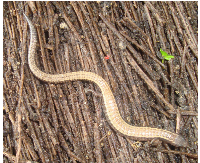
FIGURE 1. Specimen of Anotosaura vanzolinia collected in Serra da Mão, municipality of Traipu, state of Alagoas (MUFAL 8768).

SD=9.01). The new record corroborates earlier comments by Rodrigues (1986) and Delfim and Freire (2007), who suggested that the preferred habitat for this species is the forest and that it remains in caatingas only in especially favorable microhabitats.