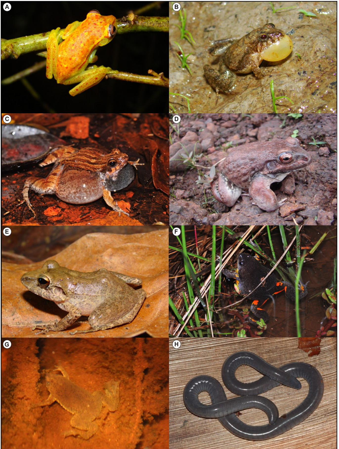
FIGURE 3. A = Hypsiboas punctatus , B = Pseudopaludicola canga , C = Physalaemus ephippifer , D = Leptodactylus syphax , E = Pristimantis fenestratus , F = Elachistocleis carvalhoi , G = Pipa arrabali , H = Caecilia tentaculata (Photo: Adriano Maciel).