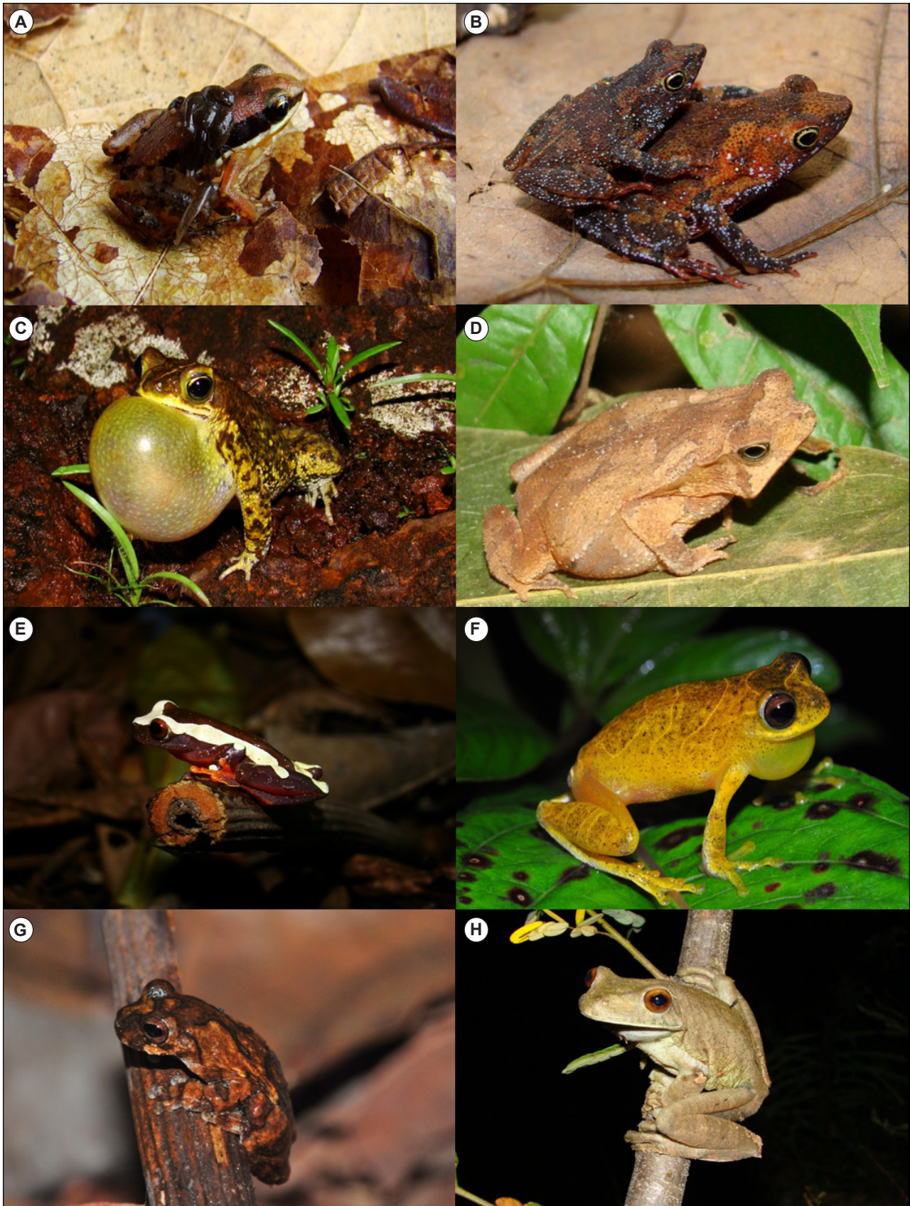
FIGURE 2. A = Allobates gr. marchesianus , B = Amazophrynella minuta , C = Rhinella mirandaribeiroi , D = Rhinella gr. margaritifera , E = Dendropsophus leucophyllatus , F = Dendropsophus minutus , G = Dendropsophus melanargyreus , H = Hypsiboas boans .

precise comparisons among areas in Amazonia and, consequently, conservation measures based in the observed diversity of a given area, are threatened, reflecting severe biases regarding the actual compositional similarity among areas to be selected for conservation purposes.