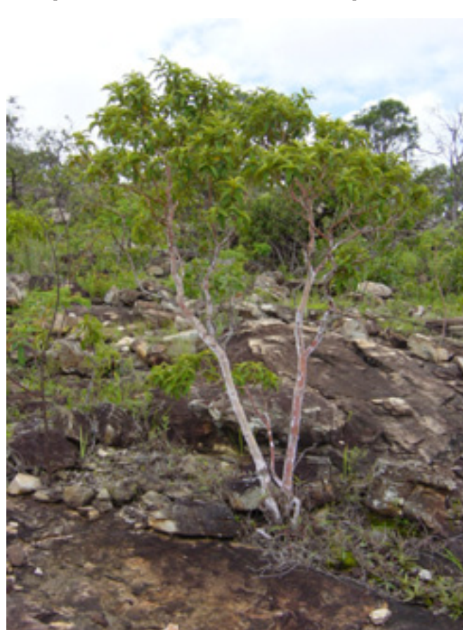
FIGURE 1. Tibouchina papyrus (NX 9900) from cerrado rupestre of Nova Xavantina, Serra do Roncador, MT.