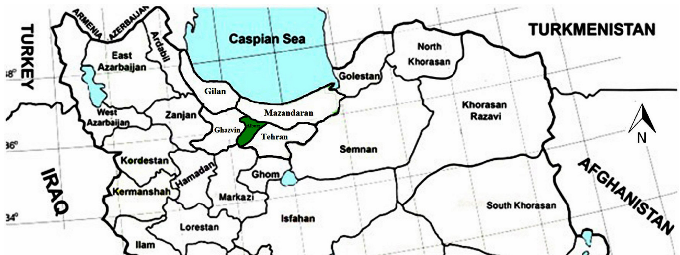
FIGURE 1. Iran- Alborz province, where the Cononedys bituberculata specimens have been collected.

Material for this study was collected from different habitats of the northern Iran using malaise traps during 2010. Samples were collected between March and November. The specimens were extracted from the malaise traps and sorted weekly. Specimens were dehydrated in 99.6% ethanol for 5-10 minutes and then placed in a pure solution of hexamethyldisilazane (HMDS) for 15-20 minutes. The specimens finally placed in a glass plate for drying. The dried specimens were then labeled. Morphological terminology follows Greathead and Evenhuis (1997) and Zaitzev (1996). Description of female genitalia follows Lamas et al. (2002). Female genitalia preparations were made by macerating the apical portion of abdomen in cold 10% KOH for 14-15 hours, and then washed with distilled water and transferred to glycerin.