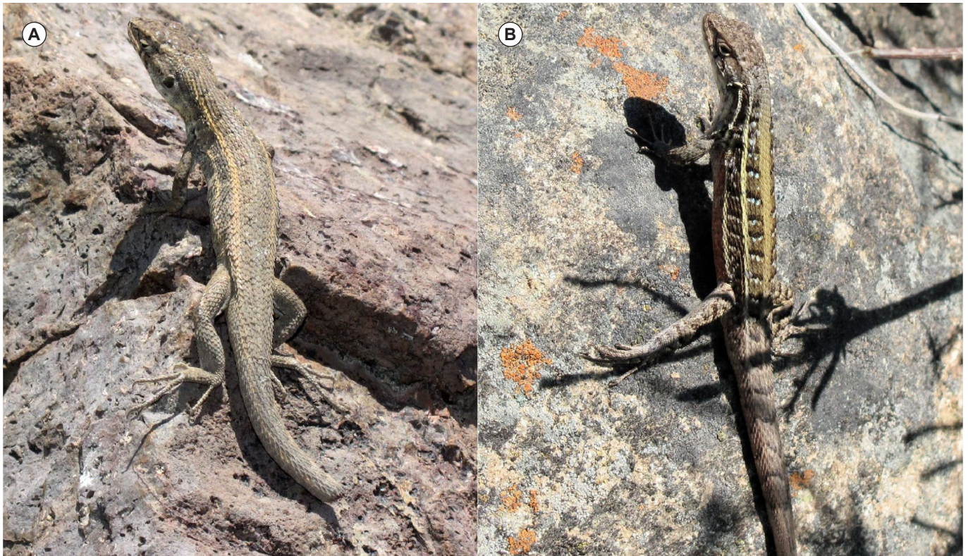
FIGURE 2. View of dorsal pattern coloration in life. (A) Adult male of Liolaemus pseudolemniscatus (Re-0030). (B) Adult male of Liolaemus lemniscatus from Machali.