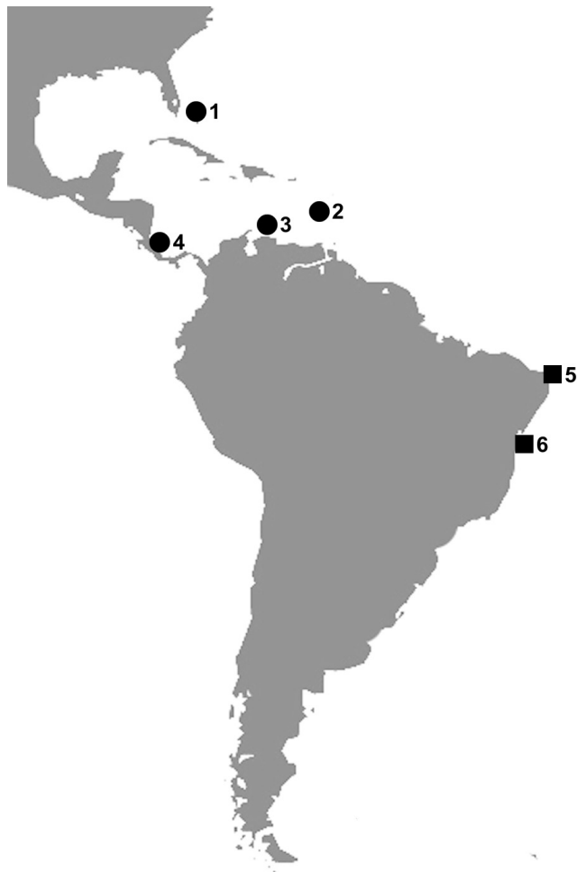
FIGURE 1. Geographic distribution of Flabellina dana . Previous records (circles): 1. Bahamas; 2. St. Lucia (type locality); 3. Curaçao and 4. Costa Rica (Valdés et al. 2006). New records (squares): 5. Rio Grande do Norte and 6. Bahia, Brazilian northeastern coast.

Among the Flabellinidae the species that most resembles F. dana is F. dushia . Some common characteristics are the opaque white color on the head, oral tentacles and most of the dorsum; the foot bilabiate and notched with long propodial tentacles; the pleuroproctus anus, posterior to inter-hepatic space; and the renal and genital opening location. However, the two species can be easily morphologically differentiated due to characteristics in the head, mouth and rhinophores. Flabellina dushia presents rounded head, terminal and triangular mouth and smooth rhinophores, while F. dana has oval head, vertical and sub-terminal mouth and annulate rhinophores (Millen and Hamann 2006; Valdés et al. 2006). The rhinophore is an important diagnostic characteristic of F. dana . It is the only known western Atlantic Flabellinidae with annulate rhinophores (Figure 2C) (Millen and Hamann, 2006).