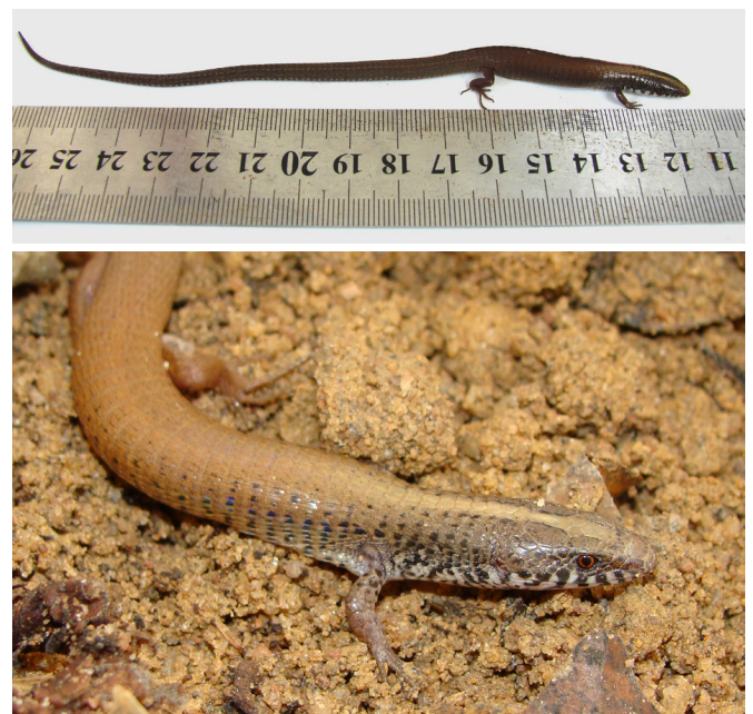
FIGURE 1. Specimen of Acratosaura mentalis (ca. 45 mm SVL) captured, photographed, and released in the municipality of Floresta, state of Pernambuco, Brazil. Photos (LPE 1786) by CEMFAUNA-CAATINGA and Melissa Gogliath.

43, 44, 66, 204, 719, 797, 909, 976, 1027, 1041, 1111, 1294; 08°05'15" S, 37°38'35" W; 542 m asl) and Floresta (N = 17: LPE 166, 178, 180, 245, 613, 921, 940, 1032, 1048, 1203, 1331, 1333, 1487, 1489, 1500, 1822, 1823; 08°36'04" S, 38°34'07" W; 316 m asl). These three collection sites lie in the Caatinga and are characterized by shrub vegetation on a sandy soil. Our new findings of A. mentalis in the municipalities of Sertânia, Custódia and Floresta (Figure 3) extend the distribution of this species ca. 60 km north, 75 km northwest and 120 km west, respectively, from the nearest collection site in the municipality of Buíque, state of Pernambuco (Vale do Ipanema; 08°37'24" S, 37°09'23" W; 798 m asl). In Buíque, specimens of A. mentalis were collected in the Parque Nacional do Catimbau (Muniz and