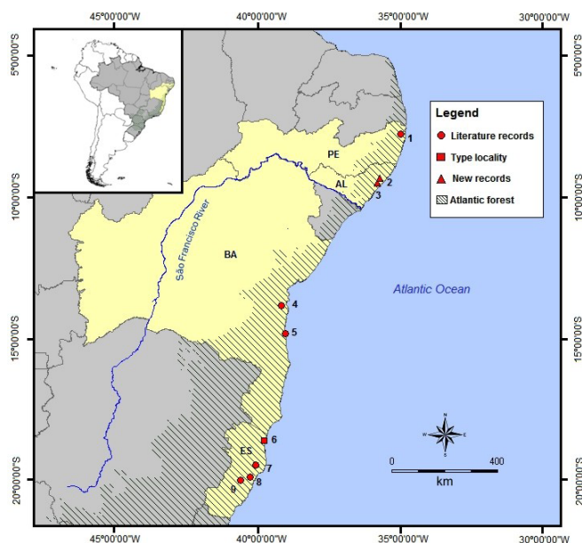
FIGURE 2. Geographic distribution map of Dendropsophus haddadi . New records (red triangles) – state of Alagoas (AL): Serra da Saudinha, Maceió (2) and Mata do Catolé, Maceió (3). Literature records (red square and red dots). See Table 1 for localities names, numbers and references.

portions of Bahia and Espírito Santo) and shows that as surveys in the northeast of the country are intensified, species previously restricted to the region below the São Francisco River may have a much wider distribution.