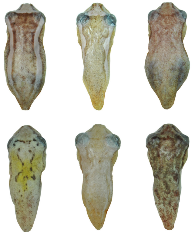
FIGURE 3. Dorsal color pattern variation found in individuals of Dendropsophus haddadi from Serra da Saudinha and Mata do Catolé, Maceió, Alagoas state, Brazil (from left to right MUFAL 5514, 3313, 5513, 9076, 3424 and 9778).