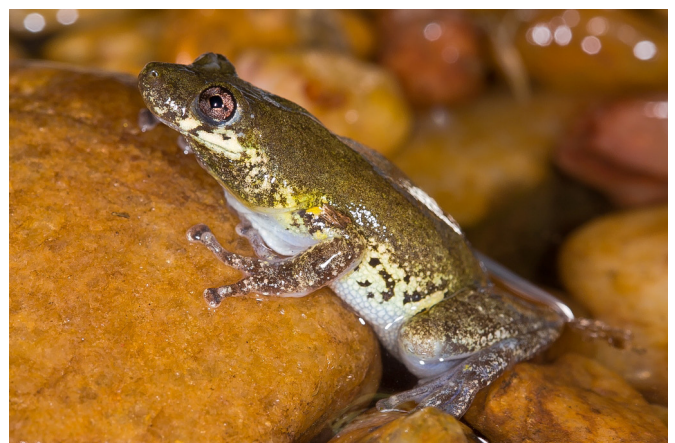
FIGURE 1. Adult male of Scinax camposseabrai from Curaçá, Bahia (C02270).

Despite the putative rarity of Scinax camposseabrai , these records indicate that the species can potentially be found in several habitat types as Seasonal Forests, Gallery Forests, Arboreal Caatinga, and open cerrado-like habitats at "planalto sul-baiano" (Maracás), Espinhaço mountain range (Matias Cardoso and Igarorã), and the São Francisco dry plains. At these areas the specimens were observed on temporary ponds formed by strong rains. The species is more often observed on soil or close to soil, perched on low scrubs and grasses. Bokermann (1968) reported