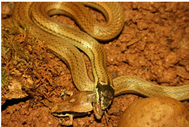
FIGURE 1. A male specimen of Taeniophallus affinis (CRUPF 1698; SVL = 502 mm) eating a frog ( Physalaemus gracilis ) collected in Sertão, Rio Grande do Sul, Brazil.

Taeniophallus affinis (Günther 1858) is a snake of the family Dipsadidae with a wide distribution in the Atlantic Forest of southeastern and southern Brazil (Di-Bernardo and Lema 1988; Di-Bernardo 1992). It occurs from the southeastern part of the state of Minas Gerais to the states of Espírito Santo, Rio de Janeiro, São Paulo, Paraná, Santa Catarina, and Rio Grande do Sul. The southernmost record of this species is from the northeastern part of the state of Rio Grande do Sul (Di-Bernardo and Lema 1988; Di-Bernardo 1992). The natural history of T. affinis is poorly documented; it is terrestrial, living amidst leaf litter and its diet consists of anurans and lizards (Marquez et al. 2001; Condez et al. 2009; Zacariotti and Gomes 2010).