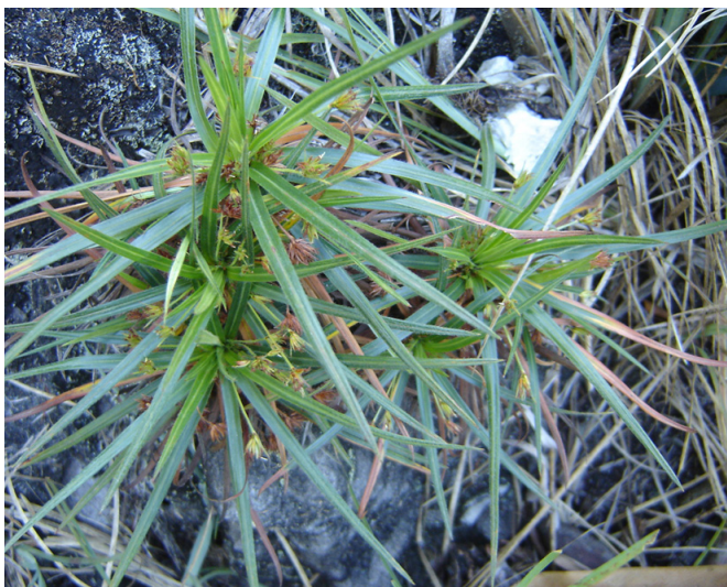
FIGURE 1. Cephalocarpus confertus in the wild.

This perennial sedge, C. confertus , is characterized by its terete stems, tristichous leaves, capitate terminal inflorescence, presence of prophylls inflorescences, tristichous glumes, unisexual flowers, monoecy, presence of one or two stamens, trifid stigma, achene-type fruits, with the persistent style base and utricle adnate to achene (Figure 2).