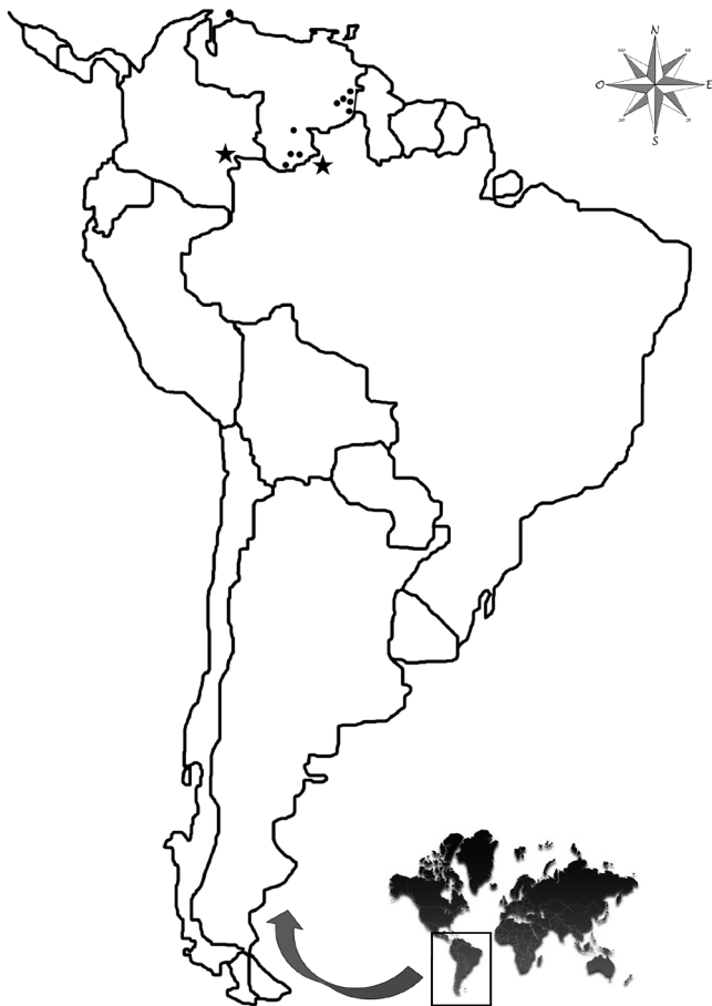
FIGURE 3. Distribution of Cephalocarpus confertus . Circles shows the distribution in Venezuela and stars shows expanded distribution in Brazil and Colombia.

These two collections exclude C. confertus from the endemic species list for Venezuela, but it remains endemic to the Guyana Shield in northern South America (Figure 3), in altitudes ranging from 400 to 2,450 m.