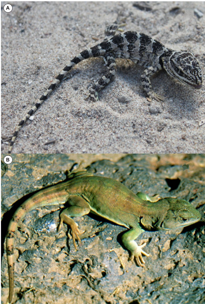
FIGURE 2. New records of Pristidactylus nigroiugulus : (a) Juvenile female (SVL = 64.61 mm, LJAMM-CNP 13090) for Languiño Department, Chubut, Argentina; (b) Adult male specimen (SVL = 97.46 mm, LJAMM-CNP 3888) for Escalante Department, Chubut, Argentina.