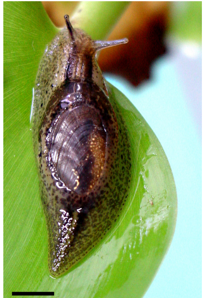
FIGURE 1. Live specimen of Omalonyx unguis on aquatic vegetation from Fazenda São Francisco, in Miranda, Mato Grosso do Sul State, Brazil. Scale bar = 5 mm.

The presence of O. unguis in the material that we examined confirms that the geographical distribution of this species encompasses two hydrological systems in Brazil. The first is the Paraguay River sub-basin, which drains the Pantanal region of western Brazil. The second is the Paraná River where it forms the border between Brazil and Paraguay. These new records extend the range of O. unguis northward, and the map in Figure 3 shows the new profile of its distribution.