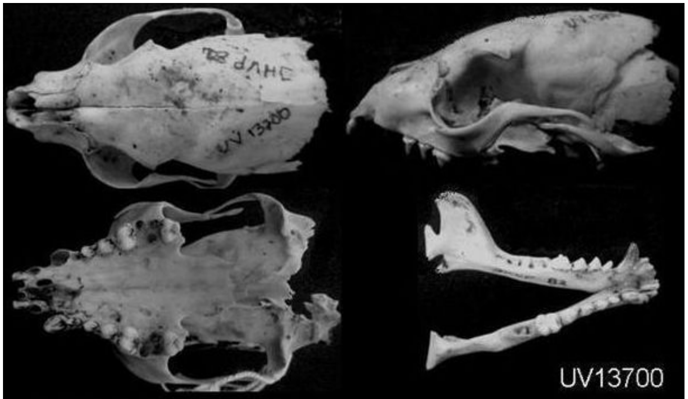
FIGURE 2. Olingo ( Bassaricyon gabbi ) specimen from the eastern slope of the western range of the Andes, Valle del Cauca Department, Colombia.

We believe frequent misidentification of olingos as kinkajous is at least part of the cause for the absence of olingo documentation in this region in the past. In addition, El Duende Regional Reserve has not been well studied. Although research on a number of vertebrate groups in the Reserve has resulted in significant contributions to our understanding of tropical species, knowledge of medium-sized, nocturnal mammals is still poor. There is a significant amount of knowledge among local human inhabitants in the region that could be useful in filling gaps about the ecology and distribution of these species. In particular, older local hunters are an important source of information that may help to complete our knowledge concerning the distributions of species, particularly, medium-sized mammalian carnivores.