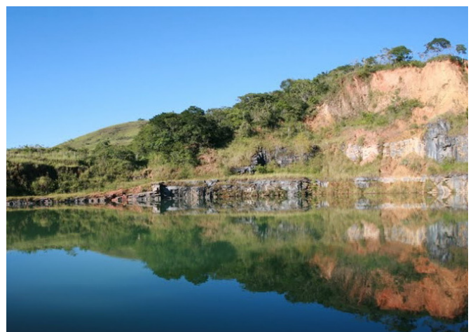
FIGURE 2. Blue Lake in the municipality of Prados, Minas Gerais.