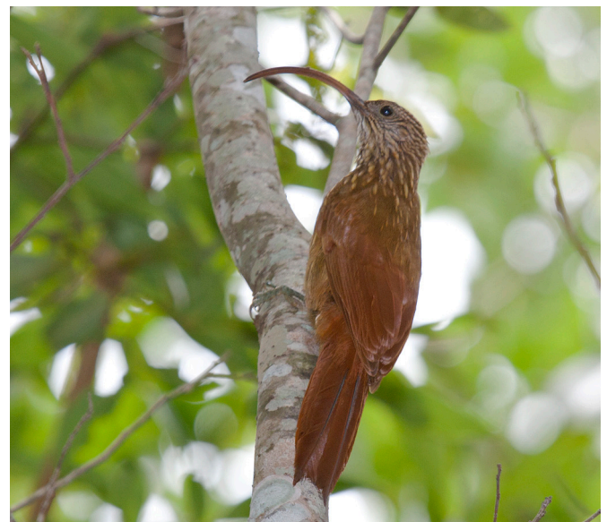
FIGURE 1. Campylorhamphus trochilirostris in a riparian forest of São José dos Dourados River, at Nhandeara, São Paulo, Brazil.

It is noteworthy that, despite being well known to the state of Paraná, including the central region, the distribution maps of the species in recent bibliographies do not include this state ( e.g. Perlo 2009; Ridgely and Tudor 2009; Sigrist 2009). This shows the need of a revision on the distribution of C. trochilirostris in south and southeastern Brazil.