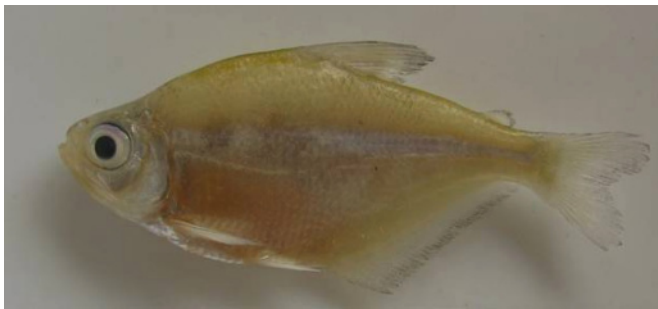
FIGURE 2. Astyanax pelegri , ILPLA 1964, 59.9 mm SL, lower Río Pilcomayo, Pilcomayo Department, Pilcomayo river basin, Formosa province, Argentina.

As a result of these surveys, two new species records are added to the ichthyofauna of the Formosa: A. pelegri (Figure 1B) and T. pantanensis (Figure 1C). The first one was previously reported in Chaco, Buenos Aires, and Santa Fe provinces. In turn, the occurrence of T. pantanensis in the RPNPRS represents the first record for Argentina and the southernmost for this species, being until now only mentioned for the Pantanal region in Mato Grosso, Brazil. These results indicate the need to gather more ichthyological information from these dynamic environments, where their hydrological regime supported by regional floods from the Pilcomayo River favors a constant rate of recolonization and exchange of species.