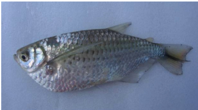
FIGURE 3. Triportheus pantanensis , ILPLA 1969, 107.46 mm SL, Laguna Blanca, Pilcomayo Department, Pilcomayo river basin, Formosa province, Argentina.