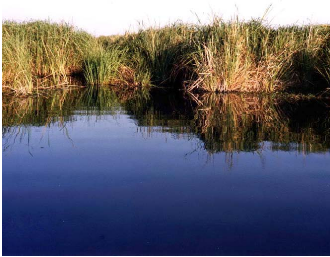
FIGURE 3. Laguna Galarza, Esteros del Iberá Wetlands, Corrientes province, Argentina.