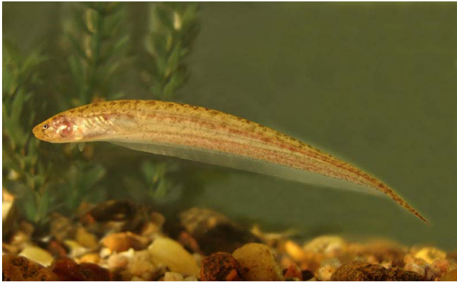
FIGURE 2. Brachyhypopomus bombilla , MACN ict 9458, 64.5 mm LEA, Arroyo Las Mangas, Pre-Delta National Park, Entre Ríos province, Argentina.