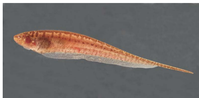
FIGURE 7. Brachyhypopomus gauderio , MACN ict 9460, 91.5 mm of LEA, Arroyo Los Dorados, Pre-Delta National Park, Entre Ríos province, Argentina.

Habitat and distribution: Brachyhypopomus gauderio was collected from many localities in the Iberá Wetlands (Figure 1) (Lagunas Iberá, Galarza (Figure 3), Luna, Paraná and San Juan, and Río Corriente), Corrientes province, and in Arroyo Los Dorados in Pre-Delta National Park, Entre Ríos province (Figures 1 and 8).