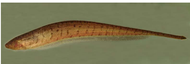
FIGURE 5. Brachyhypopomus draco , AI 268, male, 128.8 mm LEA, Arroyo Las Tortugas, Pre-Delta National Park, Entre Ríos province, Argentina.

Material examined: All material comes from the Río Paraná basin. Brachyhypopomus bombilla : AI 267, 10 exs., 90.9-131.5 mm LEA, Corrientes province, Esteros del Iberá, Laguna Galarza (28°04'56" S, 56°42'04" W). MACN ict 9457, 2 exs., 90.7-96.4 mm LEA, Corrientes province, Iberá Wetlands, Río Corriente (28°42'45" S, 58°06'40" W). MACN ict 9458, 1 ex., 64.5 mm LEA, Entre Ríos province, Pre-Delta National Park, Arroyo Las Mangas (32°07'58.7" S, 60°39'36.9" W).