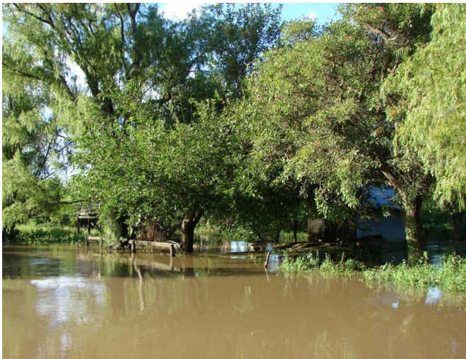
FIGURE 4. Arroyo Las Mangas, Pre-Delta National Park, Entre Ríos province, Argentina.