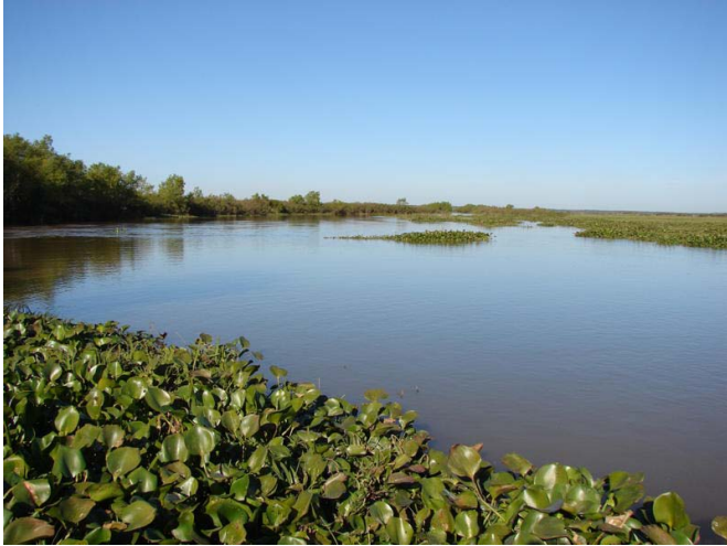
FIGURE 8. Arroyo Los Dorados, Pre-Delta National Park, Entre Ríos province, Argentina.

As noted by Giora and Malabarba (2009), B. bombilla , B. draco and B. gauderio can be sympatric and syntopic. In the Pre-Delta National Park both conditions are true for the three species. On the other hand, B. bombilla and B. gauderio share the same environment with abundant floating vegetation in the Iberá Wetlands.