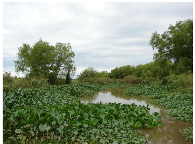
FIGURE 6. Arroyo Las Tortugas, Pozo Hondo, Pre-Delta National Park, Entre Ríos province, Argentina.

Material examined: Brachyhypopomus draco : All material comes from the Río Paraná Basin. AI 268, 2 exs., 117.7-128.8 mm LEA, Entre Ríos province, Pre-Delta Matinal Park, Pozo Hondo, Arroyo Las Tortugas (32°08'40.3" S, 60°39'02.2" W).