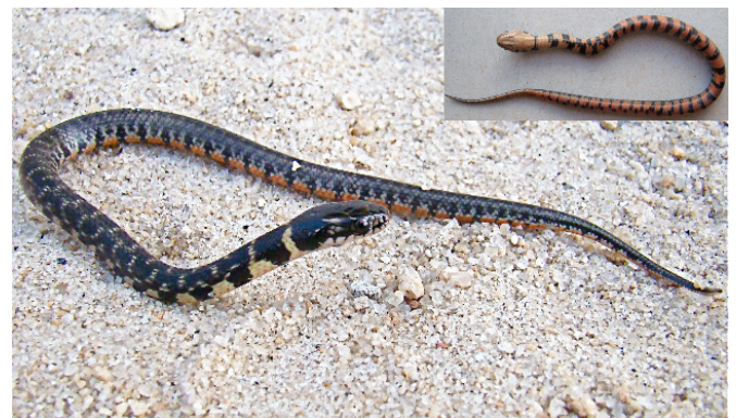
FIGURE 1. Liophis taeniogaster from municipality of Rio Tinto, PB, Brazil.

off road at 07:00 h (6°48'20" S, 35°04'39" W). Despite the snake was recorded in a disturbed area, the city is close to one of the most important reserves of northeast Atlantic forest, the Reserva Biológica Guaribas. This reserve is a patch with 4.028 ha included in the 2 % of the original forest remaining of northeast Atlantic forest (Silva and Tabarelli 2000), and encloses several fauna and flora species characteristic of the region. The Reserva Biológica Guaribas presents two different vegetation formations (Salgado et al. 1981): semi-deciduous rainforest (primary and secondary formation) and savanna.