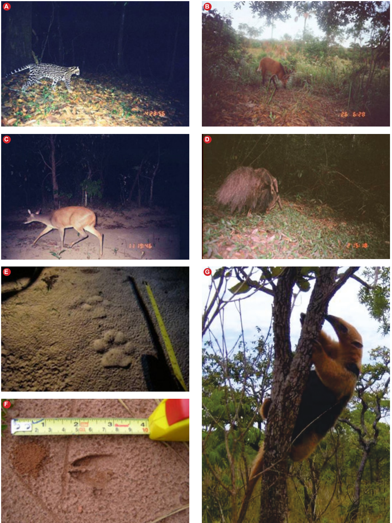
FIGURE 3. Photographic records of mammals captured with camera traps or observed indirectly at the Estação Ecológica do Panga (Minas Gerais State, Brazil). (A) Leopardus pardalis in mata ciliar, (B) Chrysocyon brachyurus in vereda, (C) Mazama guazoubira in cerrado sentido restrito, (D) Adult Myrmecophaga tridactyla carrying juvenile in mata ciliar, (E) Puma concolor tracks in cerrado sentido restrito, (F) Mazama guazoubira track in cerrado ralo, (G) Tamandua tetradactyla in cerrado ralo.