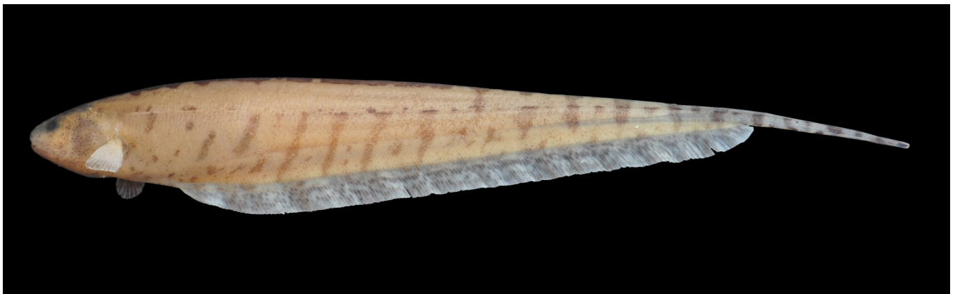
FIGURE 1. Picture of female Brachyhypopomus gauderio Giora and Malabarba 2009 collected in a wetland area of the Taim Ecological Reserve, Rio Grande do Sul state, Brazil.

Brachyhypopomus gauderio is widely distributed in the central, southern and coastal regions of the Rio Grande do Sul (RS) state, southern Brazil, especially in lagoons, rivers margins, slow-moving creeks and flood areas