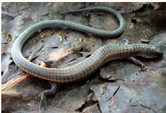
FIGURE 1. Adult female Heterodactylus imbricatus (CRLZ 000074) from the Reserva Biológica do Unilavras - Boqueirão, municipality of Ingai, state of Minas Gerais.

On 7 November 2008 and 17 September 2009, one adult female (6.14 mm snout-vent length; Figure 1) and one adult male (9.68 mm snout-vent length; Figure 2) Heterodactylus imbricatus were collect in Reserva Biológica Unilavras - Boqueirão (RBUB) (21°20'47" S, 44°59'27" W, 1,250 m elevation) (Figure 3) municipality of Ingai, state of Minas Gerais (permits: SISBIO/14740-1,