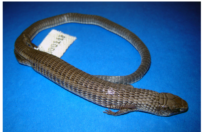
FIGURE 2. Adult male Heterodactylus imbricatus (CRLZ 000143) from the Reserva Biológica do Unilavras - Boqueirão, municipality of Ingai, state of Minas Gerais.

register 1971350). The habitat encompasses riparian forest associated with physiognomies of Cerrado.