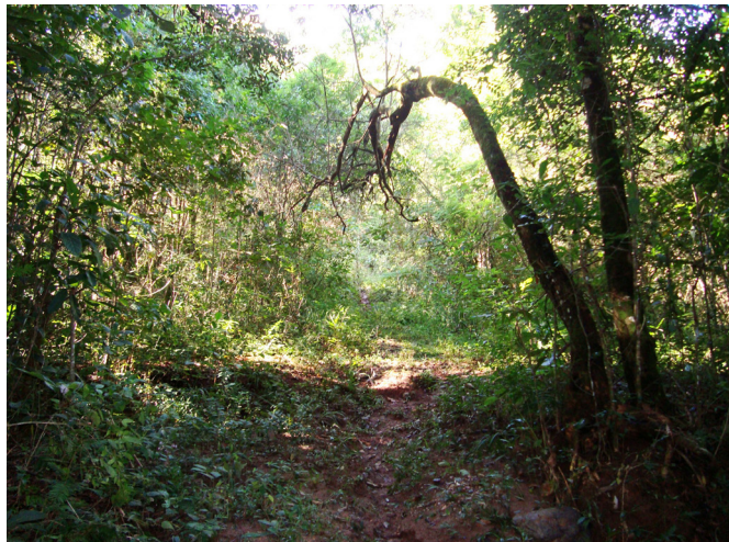
FIGURE 3. Study area, located in the Reserva Biológica do Unilavras - Boqueirão, municipality of Ingaí, state of Minas Gerais.