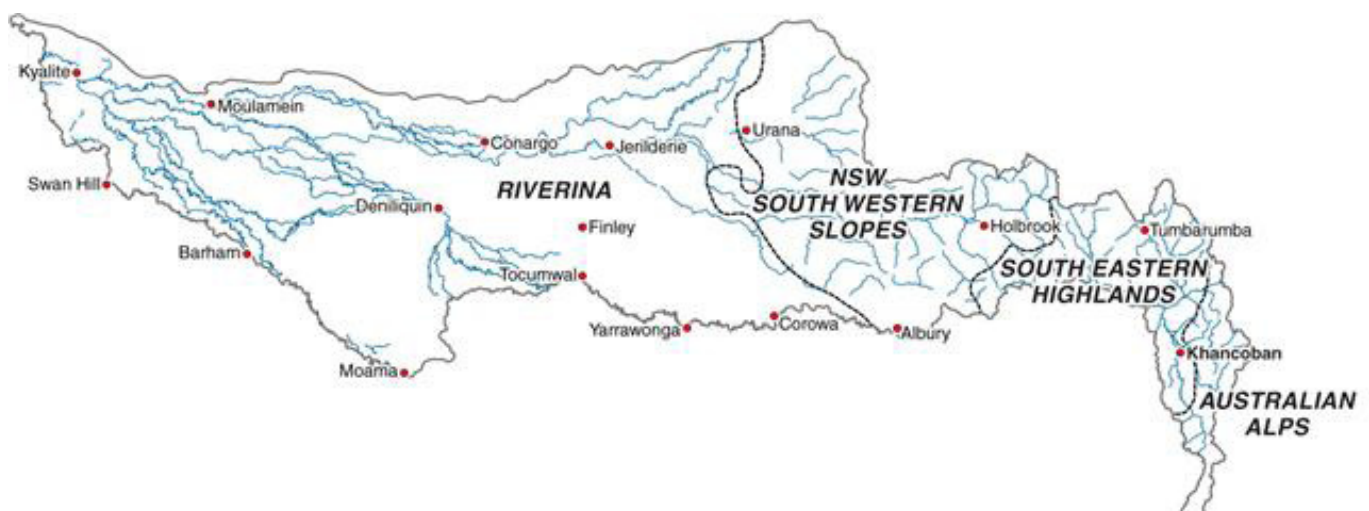
FIGURE 2. Major towns and bioregions of the Murray Catchment Management Area, New South Wales, south-eastern Australia.

For the granite outcrop sites, reptiles were actively sought behind bark, within rock crevices, and beneath fallen timber, surface rocks and leaf litter within a 4 ha search area (200 m x 200 m). Field ecologists from The Australian National University completed each survey (DM, MC, RMD, CM and LM). In the Riverina, sites were surveyed during October 2008 and August 2009. In the SWS, remnants and planting sites were surveyed during August 2003 and November 2002, 2003, 2005 and 2008. Granite outcrops were surveyed between October 2006 and February 2007, and surveys on Nail Can Hill Flora and Fauna Reserve were conducted annually between 1997 and 2009 by DM for comparison. All surveys were conducted between 09:00h - 16:00h on clear days with minimal wind. Surveys were conducted under the Department of Environment and Climate Change scientific license number S12604.