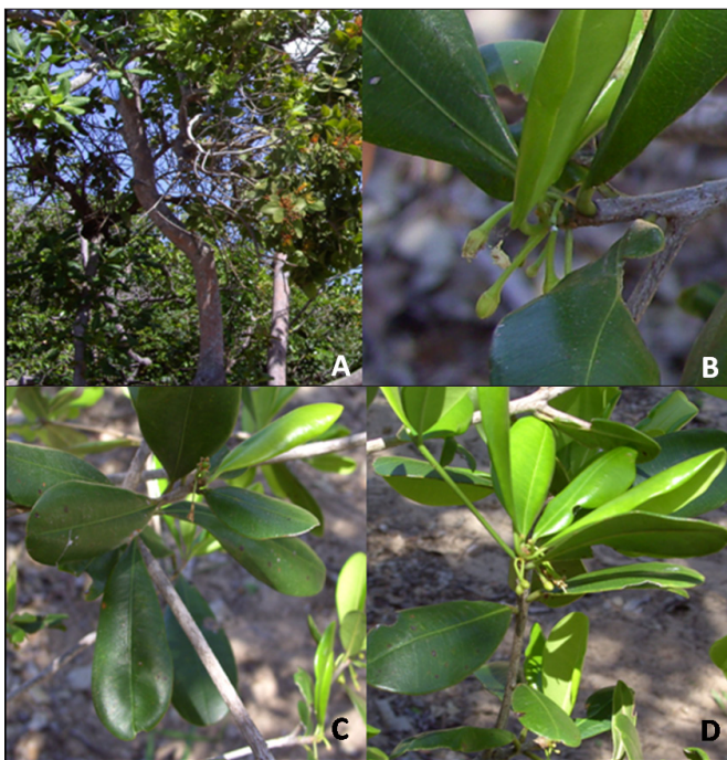
FIGURE 1. Specimen of Manilkara cavalcantei collected in an area of coastal “restinga” vegetation on Ilha Grande, Piauí state, Brazil. A – Habit; B – flower bud detail; C and D – Branches detail.

The examined specimens of M. cavalcantei (F.S. Santos-Filho, 955; W. Rodrigues et al. 8546) are deposited in the IPA and INPA Herbarium collection (Holmgren et al. 1990).