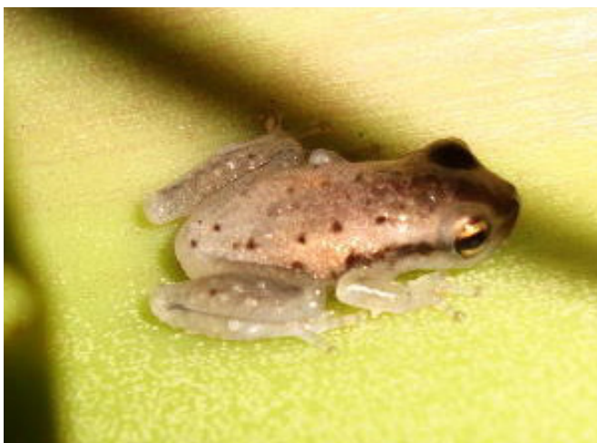
FIGURE 1. Phyllodytes punctatus (C224), Parque Nacional Serra de Itabaiana, state of Sergipe, Brazil.

Phyllodytes punctatus (Figure 1) belongs to the Phyllodytes tuberculatus group (Faivovich et al. 2005), and is characterized as a small species of pale brown color with distinctive brown dots of varying number and distribution along the dorsal surface. Until now, the distribution of this species was restricted to its type locality, at Fazenda Gravatá (10°47' S, 36°54' W), municipality of Santo Amaro das Brotas, state of Sergipe, northeastern Brazil (Caramaschi and Peixoto 2004).