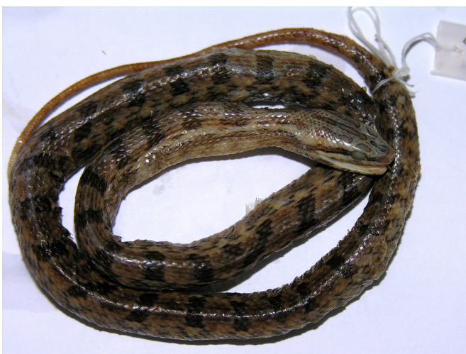
FIGURE 1. A male specimen of Tropidodryas striaticeps (MZUEFS 1168) collected in the municipality of Feira de Santana, State of Bahia, Brazil.

The compiled data (Table 1) presented here shows that T. striaticeps is more abundant (N = 257 records, 73.2%) in higher altitudes (144 records of T. striaticeps in intermediate altitudes from 251 to 750 m a.s.l and 113 records above 750 m a.s.l.), with the maximum elevation recorded at 1052 m a.s.l. at Ouro Branco municipality, state of Minas Gerais (20°31'14" S 43°41'29" W, São-Pedro and Pires 2009). These data corroborate the literature (Thomas and Dixon 1977; Argôlo 1999b; Marques et al. 2001; Marques et al. 2009). However, our records of other 94 specimens (26.8%) indicate that T. striaticeps also occurs in lower elevations (0 to 250 m a.s.l.), from the sea level in Ribeirão do Largo, state of Bahia (15°28' S, 40°45' W, CZGB 6419, Argôlo 1999b) up to 250 m a.s.l.