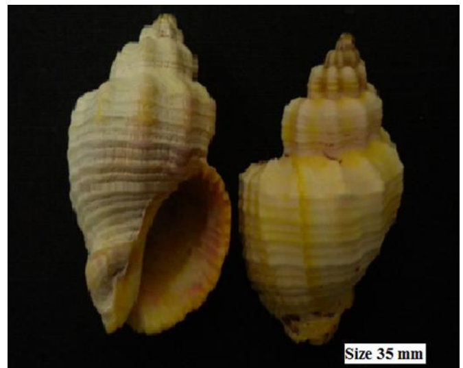
FIGURE 1. Cantharus tranquebaricus from Pondicherry mangroves, India (PUUGCMP-01).

Feeding: They feed on small crustaceans and marine worms.