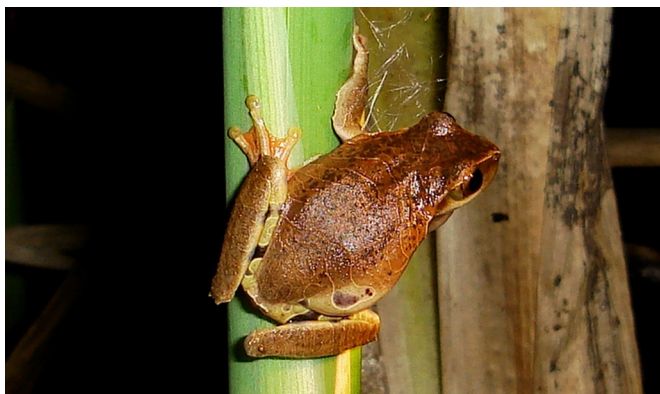
FIGURE 1. Dendropsophus anceps (MZUFV 8122, male, in life) from municipality of Ipanema, Minas Gerais.

During the last two decades, several species of Atlantic Rainforest anurans previously known only for coastal regions were recorded in more inland areas, in the state of Minas Gerais, southeastern Brazil (Feio et al. 1998; Nascimento and Feio 1999; Feio et al. 1999; Feio and Caramaschi 2002; Feio et al. 2003). The lowlands and wetlands associated with some watersheds, as those of the Doce, Jequitinhonha and Paraíba do Sul Rivers probably promoted the dispersion of these species to the inland areas (Feio et al. 1998; Feio and Caramaschi 1995; 2002; Feio and Ferreira 2005). Examples of such species are the treefrogs Dendropsophus anceps (A. Lutz, 1929) (Figure 1) and Itapotihyla langsdorffii (Duméril and Bibron, 1841) (Figure 2), which were first recorded in state of Minas Gerais at Parque Estadual do Rio Doce, municipality of Marliéria (Feio et al. 1998, 1999; Nascimento and Feio 1999). Nascimento and Feio (1999) also reported D. anceps for municipalities of Aimorés and Ipatinga, and these three localities belong to the lowlands of Doce River watershed. Since then, both species were recorded in municipality of Goianá (referred as Rio Novo by Feio and Ferreira 2005).