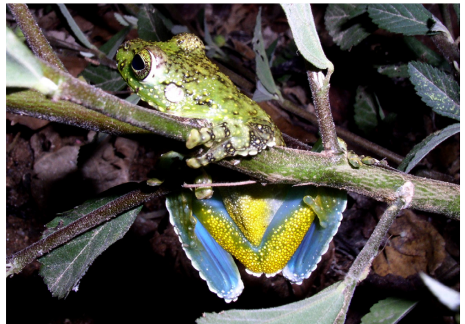
FIGURE 2. Itapotihyla langsdorffii (MZUFV 5720, juvenile, in life) from Fazenda Nossa Senhora de Fátima, municipality of Poté, Minas Gerais.