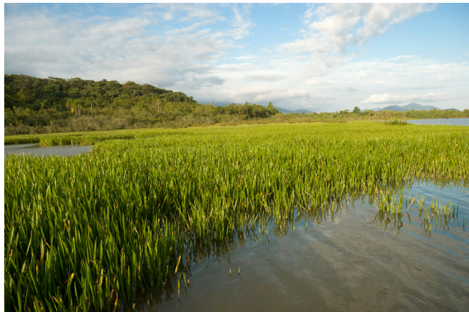
FIGURE 2. Area near sandbar, with dense formations of Crinum americanum L.