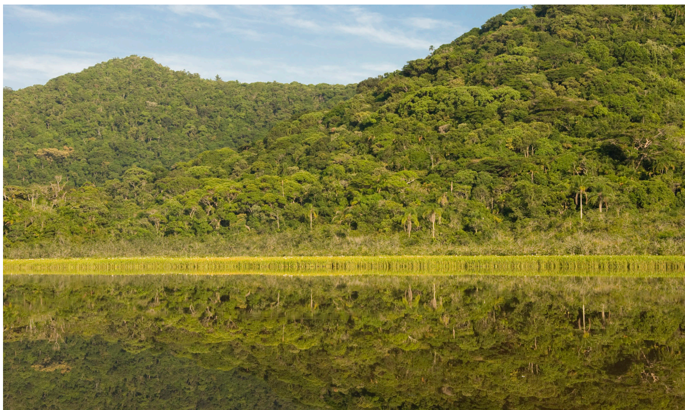
FIGURE 6. General view of estuary right margin.