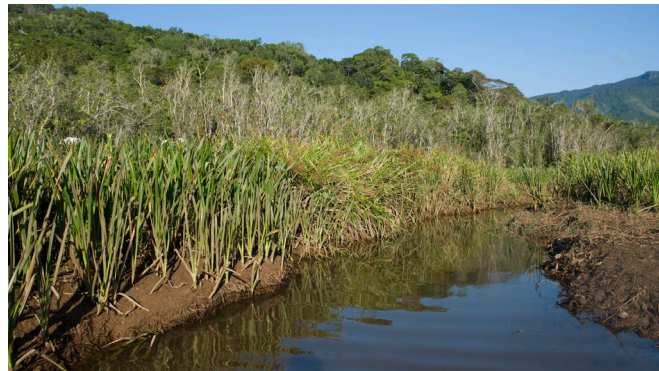
FIGURE 4. Region away from sandbar, with formations dominated by Rhynchospora corymbosa (L.) Britton, Eleocharis interstincta (Vahl) Roem. and Schult., Scleria mitis P.J. Bergius and Scleria latifolia Sw. In back plane, the arboreal compound, mainly Tabebuia cassinoides (Lam.) D.C., Annona glabra L. and Calophyllum brasiliense Cambess.