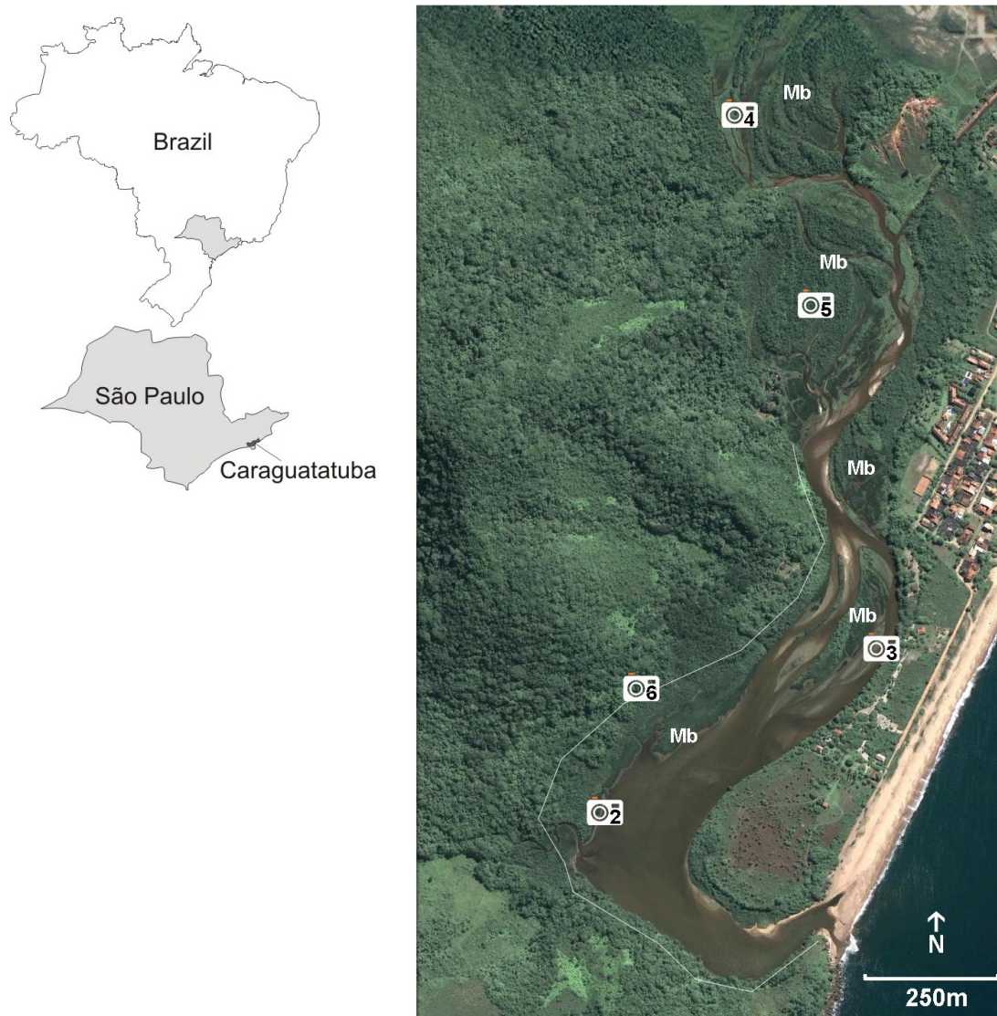
FIGURE 1. Massaguaçu River Estuary regional location and aerial image. Mb= main macrophyte banks. White line = Riparian vegetation sampling path. Camera icons= approximate location where the photographs (Figure 2-6) were taken.

The reasons for those differences are not completely clear, and there is a great demand for studies regarding plant zonation and species inventories in tropical estuaries. It has been proposed that environmental unpredictability and the wide variation in the hydrological condition lead to a lack of stress persistence (Costa et al. 2003). The unpredictability prevents the competitive balance to be reached (Russell et al. 1985), and allows species to occur in wide zones along the gradient (Baldwin and Mendelssohn 1998). The intermittent flooding stress allows riparian species to occur in the macrophyte banks, as several non-aquatic plants can cope with moderate sporadic flooding (Kozłowski 1997). Although we have not performed a formal sampling of the riparian herbaceous flora, field observations support that the opposite is also true, and several macrophytes species can live in non-flooded conditions.