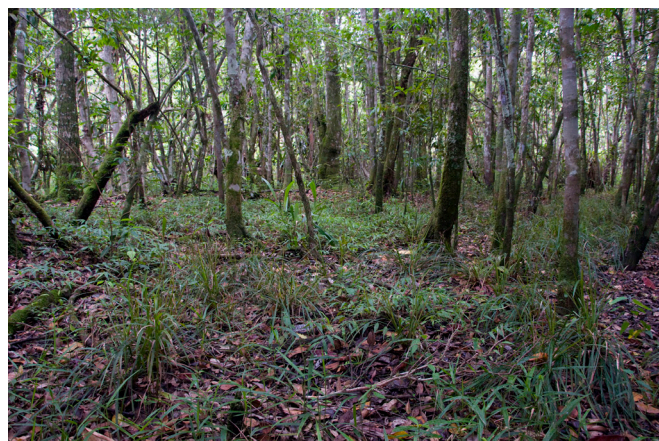
FIGURE 5. Higher plots, subjected to sporadic flooding, with arboreal stratum and several amphibian herbaceous species.