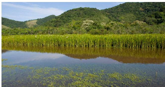
FIGURE 3. Area in an intermediary position in the estuary, just after the mouth closure, showing recently flooded formations of Bacopa monnieri (L.) Pennell and Eleocharis minima Kunth. In back plane, Crinum americanum L. and Acrostichum danaeifolium Langsd. and Fisch. In the back, tree species with several individuals of Annona glabra L., Dalbergia ecastaphyllum (L.) TAUB., and Mimosa bimucronata (DC.) Kuntze.