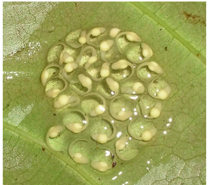
FIGURE 2. Egg clutch of H. carlesvilai found ca. 2 m above water along a stream in the urban area of Aripuanã, state of Mato Grosso, Brazil.

and attending a clutch composed by 30 eggs at night (Figure 2; eggs at UFMT) deposited on the underside of a broad leaf, ca. 2 m above the water of a rocky-bottom fast-flowing stream (ca. 1.5 m width, ca. 0.5 m depth; 10°09'21" S, 59°25'59" W) in the right margin of the River Aripuanã. Additionally, several males were heard calling along a small stream (10°08'34" S, 59°25'44" W) in a primary forest at the same municipality on 12 January 2008, at 22:58 h.