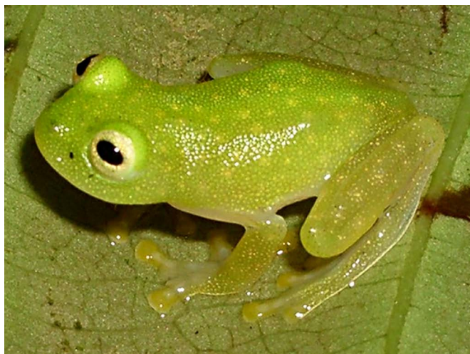
FIGURE 1. Adult male (UFMT 7078) of Hyalinobatrachium carlesvilai collected at the municipality of Aripuanã, state of Mato Grosso, Brazil.

During environmental impact studies and faunal monitoring programs conducted in areas under the impact of the Faxinal II hydroelectric power plant (PCH Faxinal II; 10°09' S, 59°27' W), municipality of Aripuanã, northern state of Mato Grosso, Brazil, we collected one individual of Hyalinobatrachium carlesvilai (UFMT 7078, zoological collection of Universidade Federal do Mato Grosso; Figure 1). This frog was found on 04 November 2006 while calling