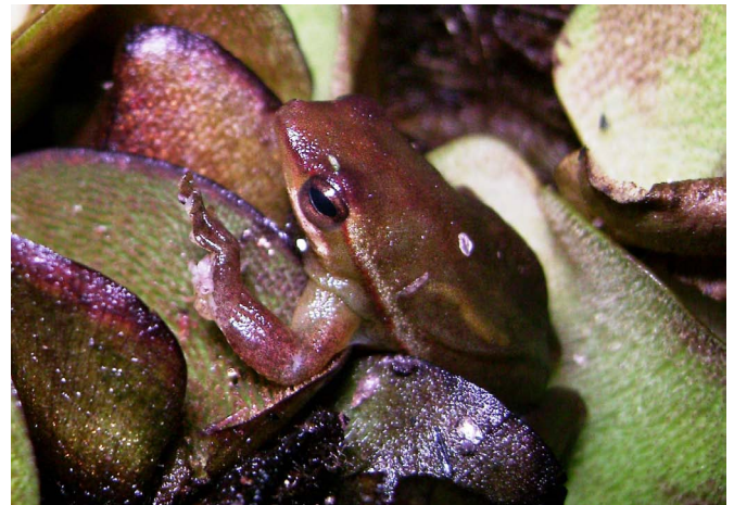
FIGURE 2. Adult male Sphaenorhynchus botocudo (MZUFV 9824 – SVL 28.6 mm ) with emphasis on the presence of the distinctive longitudinal white spot under the eye, a putative autapomorphy of the species.

preservative (Figure 3), which separates S. botocudo from all other congeners, consisting in a putative autapomorphy of the species (Caramaschi et al. 2009).