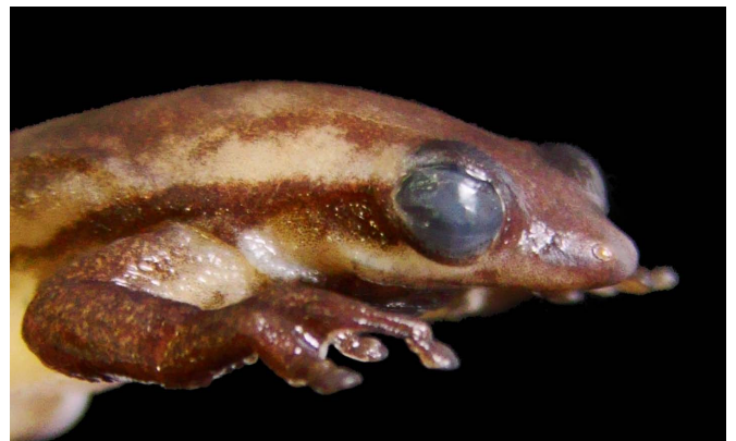
FIGURE 3. Adult male Sphaenorhynchus botocudo in preservative with emphasis on the presence of the distinctive longitudinal white spot under the eye, a putative autapomorphy of the species.