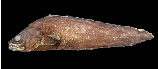
FIGURE 2. Brotula barbata (CIDRO 66, 609.2 mm TL) caught in Ceará, northeastern Brazil.

A meristic difference between the specimen we examined and the information of B. barbata from the literature was noticed. The snout barbels vary between six in Nielsen and Robins (2003) and eight in Lopes et al. (2001), but ten barbels were detected in the snout of the specimen examined. Since this was the only difference detected, we identified the analyzed specimen as B. barbata .